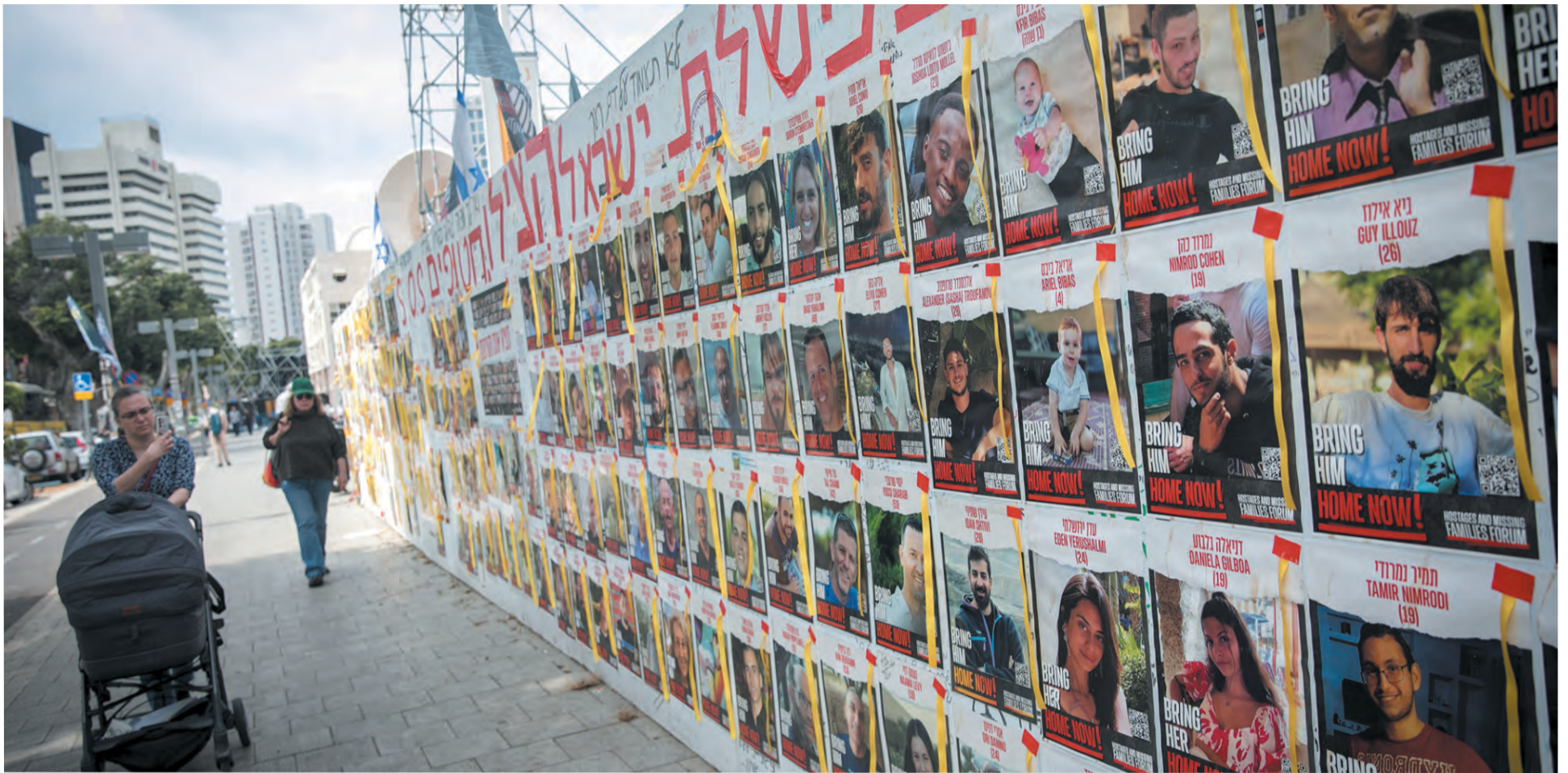
People walk by photographs of the 134 Israelis still held hostage by Hamas terrorists in Gaza, at 'Hostage Square' in Tel Aviv.

www.c4israel.org.nz | info@c4israel.org.nz