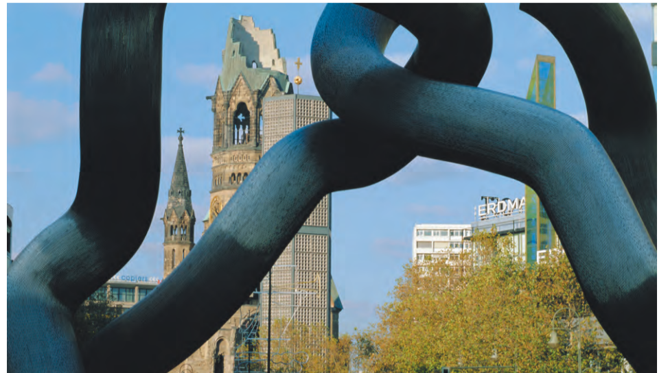
Symbolic 1930s ruined Deutsche Evangelische church was intertwined with Nazi state.

The German Christian movement was about refreshing the German church in the post-war era. Like any new movement, it offered freshness and hope and was supposedly anchored to national values, reflecting where the nation was at—relevancy. It has echoes of modern movements such as Wokeism, NAR Dominion theology, Liberation theology and the Seeker-sensitive movement. Adherents of this German movement sought office in church hierarchies to push it along. It had eight elements. Think about the movements and try to fit them into the framework below.