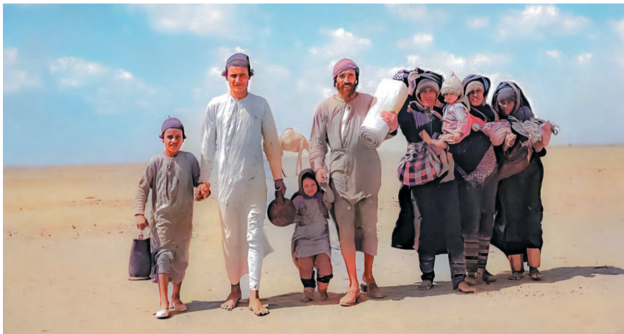
The iconic image (shown) of Yemenite Jews fleeing with minimal belongings was recreated in colour for impact.

The day chosen, 30 November, is actually a Gregorian calendar day, not a Hebrew one. It has a long official title but is colloquially known as Yom HaGirush or the Day of Expulsion. It is to remember the day after UN Res 181 passed on 29 November 1947, the Vote of the Partition Plan was to partition the land of Palestine into two states—an Israeli state and an Arab one. Partition plan for the land of Israel into two states, does that sound familiar? Amazingly, the vote was passed in the UN, with Australia and NZ supporting, amongst others, and NZ playing a key role under the auspices of PM Peter Fraser. The Arabs refused the plan, but the Jews said yes despite it being a tiny and indefensible state. Their reasoning was simple: any state is better than no state. Prior to the vote, many Middle Eastern nations threatened that if this vote passed, there would be anti-Jewish pogroms across the region, and that's exactly what happened. Jews could live in the Middle East under subjugation, but they were not allowed to have a state of their own. Does that sound familiar?