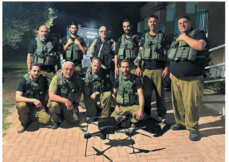
Thanks to generous donors, CFOIC Heartland purchased a surveillance drone for Argaman, a small, isolated community in the Jordan Valley. Photo: Members of the civilian rapid response team with their new drone.

We sent our soldiers off to war to save the country. Now, they have returned and will, hopefully, save the country from the politicians. That is not to say that our political leaders are bad. There is overwhelming support in Israel for the way the war is being handled, and there is pride in the accomplishments of our soldiers alongside frustration for the fact that 134 of our people are still held