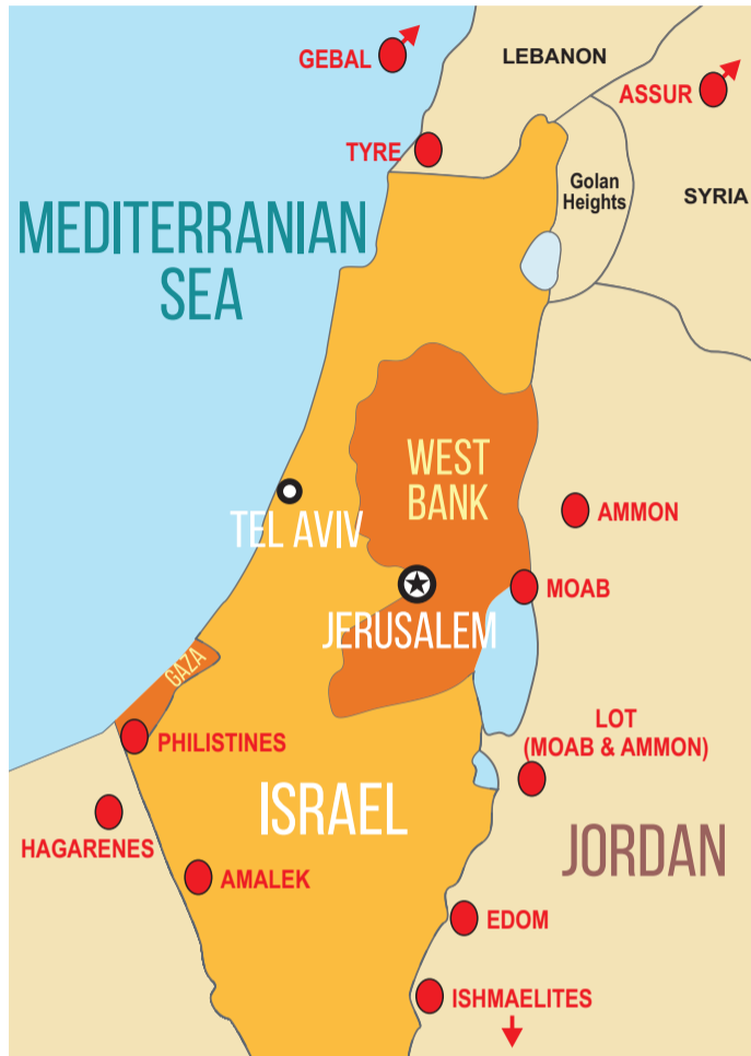
Psalm 83 Invasion: Israel and its enemies.

“Do unto them as unto the Midianites; as to Sisera, as to Jabin, at the brook of Kison: Which perished at Endor: they became as dung for the earth. Make their nobles like Oreb, and like Zeeb: yea, all their princes as Zebah, and as Zalmunna: Fill their faces with shame; that they may seek thy name, O Lord.