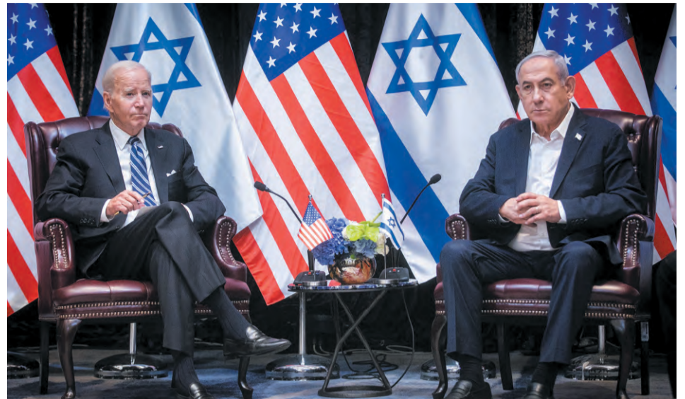
USA President Joe Biden and Israeli PM Benjamin Netanyahu meet in Tel Aviv.