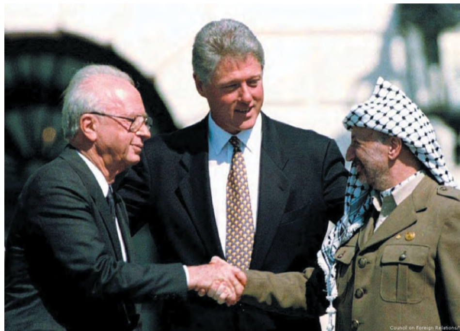
Bill Clinton, Yitzhak Rabin, Yasser Arafat at the White House 1993.

Years of propaganda and UNRWA-sponsored education have produced a Palestinian people whose whole identity is based on being oppressed and robbed by Israel. This heavy emphasis on grievance and loss of agency—and consequent appetite for terrorism—has proved disastrous economically for the Palestinians, which in turn has reinforced their sense of victimhood.