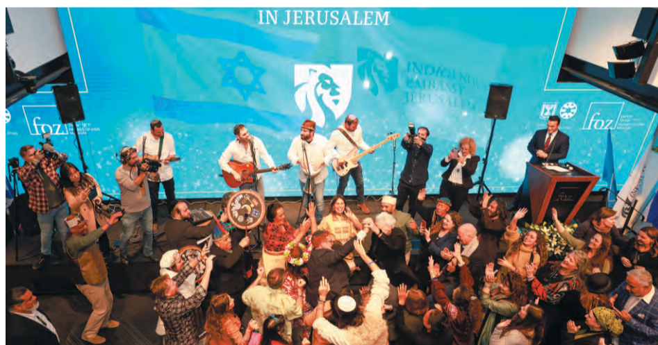
Spontaneous dancing at the opening event.

their community succeeded in fighting off the invaders.