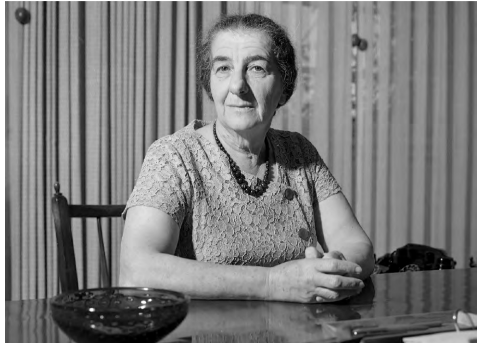
Golda Meir, former Prime Minister of Israel.

Additionally, Israel is the only democracy in the Middle East and is constantly under threat from terrorist groups who seek to destroy it. As Christians, you must stand against terrorism and support a nation that shares your values and beliefs. Moreover, by supporting Israel, Christians are also supporting the fulfillment of biblical prophecies. The return of the Jewish people to their homeland is a key sign of the end times, and by standing with Israel, Christians are playing a role in God's plan for the world. Ultimately, by supporting Israel at this time of war, Christians are showing their love for God and his people, fulfilling their spiritual duty and standing against evil in the world.