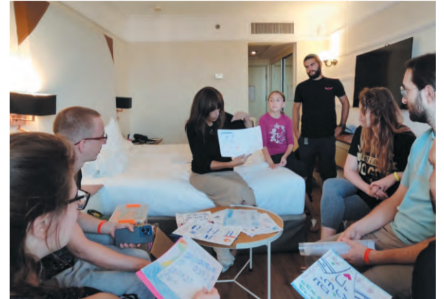
Unusual Hebrew lesson in the Hotel

We welcome your support for families integrating into Israel through First Home in the Homeland! Please complete the coupon below.