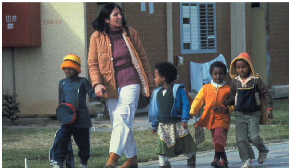
Immigrant children from Ethiopia at the reception centre in Kiryat Gat.

In between the tourism, truckloads of Ethiopian Jews were smuggled out of the refugee camps and brought to