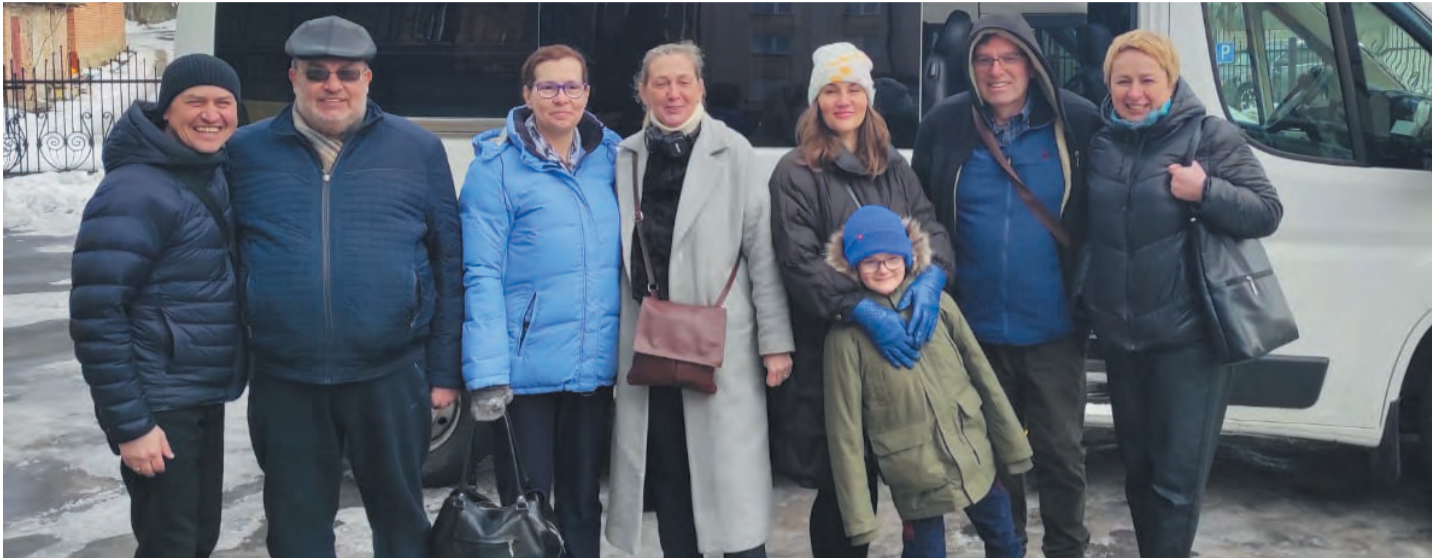
A group that recently made Aliyah with our help.