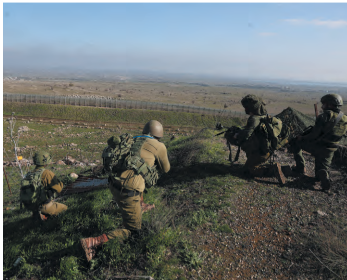
Israeli infantry soldiers near the Israeli border with Syria.

In Israel, barrages of more than 1,500 rockets per day are expected, which will pose problems for air defences.