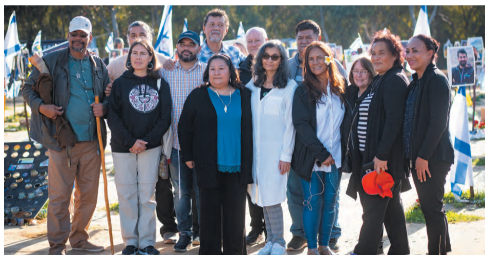
Some of the Indigenous delegates at the site of the Nova massacre.