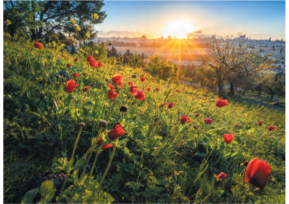
Beautiful sunburst over the Old City of Jerusalem.

And, in the Scripture we are looking at, he speaks to the (physical and spiritual) "waste places [of] Jerusalem" to "break through together into joyful singing... for the Lord has comforted His people, He has redeemed Jerusalem" ( Isaiah