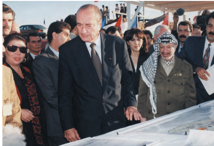
PLO Chairman Yasser Arafat pictured meeting with French President Jacques Chirac in 1996.

I was reminded of similar events in WWII. From the 1920s, Amin al-Husseini, Grand Mufti of Jerusalem, was so highly