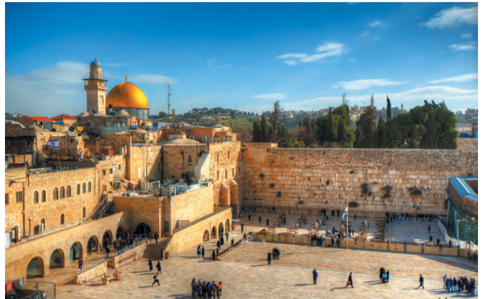
The Wailing Wall in Jerusalem.

However, the events of 7 October show how quickly long-held views can change. Prior to this heinous terror attack, the majority of Israelis were seeking to get on with their lives in some kind of peaceful co-existence, with Hamas being contained by Israel’s state-of-the-art