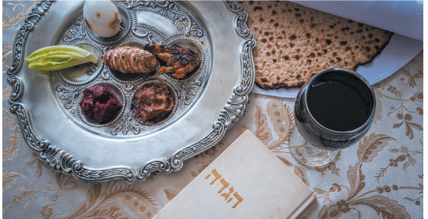
Passover table setting with a Seder plate and a Hagadah (the guidebook for Seder meal).

Seder night is a remembrance of the miserable time the children of Israel went through in Egypt. In breaking bread and drinking wine, the Lord points to His body and blood ( Luke 22:19 and 1 Corinthians 11:24-25 ). In Exodus 12:14 , Passover was instituted as a remembrance of the exodus from Egypt. Messiah instituted Holy Communion in remembrance of His suffering and death. The great teacher of the apostle Paul, Rabban Gamliel, says: “In every generation, man is obliged to consider himself as if he himself had gone out of Egypt, as it is written, ‘proclaim it to my children on that day’” ( Mishnah tractate Pesachim 10:5 ). The apostle echoes him regarding the Lord’s Supper: “For as often as you eat this bread and drink the