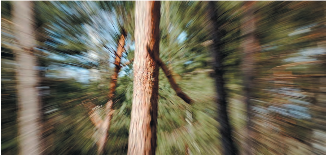
Shifting Perspectives—Photograph taken with a zoom lens; focal length was varied during the course of the exposure

The Greek historian Herodotus famously said "No water flows in the same river twice." It is human nature