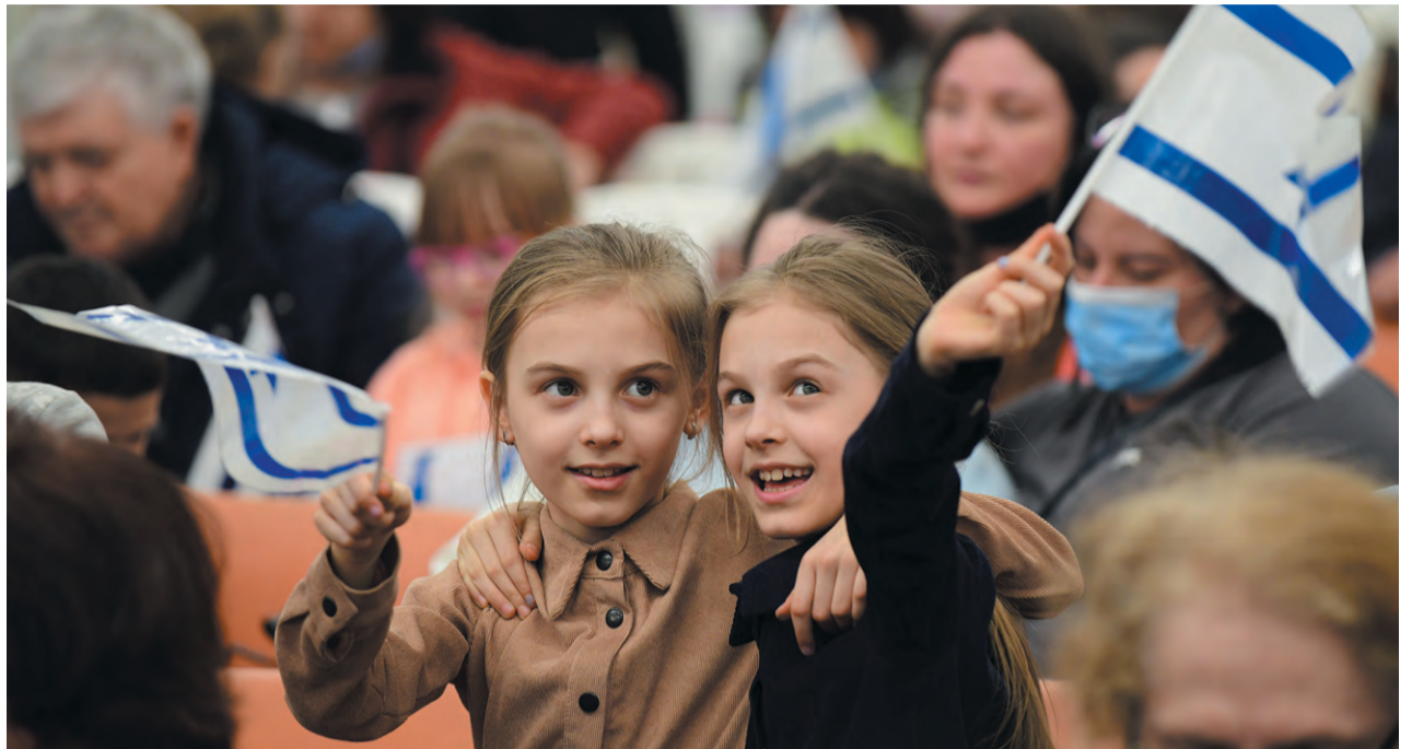
Jews from all over the world are returning to Israel. Like these girls from Ukraine, who have just arrived at Ben Gurion Airport. Excitedly, they are looking forward to what is to come.

John sees in the Book of Revelation burning stars falling from the sky. He speaks about the destruction of one-