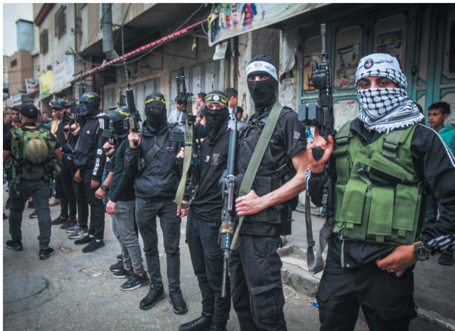
Palestinian gunmen from the Fatah movement hold their weapons during a parade in the Balata camp in city of Nablus.

operations (i.e., terror attacks) against the Israeli occupation were led by the Fatah Movement members and the [PA] Security Forces members [in 2023]"