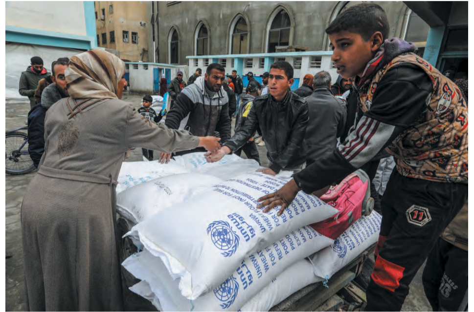
Relief supplies are distributed from UNRWA headquarters in Gaza. However, much of the emergency goods currently reaching Gaza are immediately seized by Hamas and then sold back to Gazans.

That disaster was predictable. The international community has willfully ignored the fact that through the UN agency UNRWA, billions in aid funds were used to radicalise entire