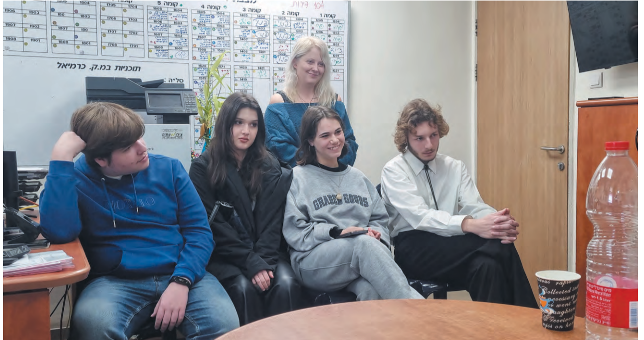
The youth in Karmiel, after they had just arrived in Israel from Ukraine to study in Israel.

Karmiel in Galilee is the absorption centre for young people from Ukraine and the former Soviet republics. A group of thirty young people aged 16 and 17 who follow the Sela study programme arrived in November. Back in Ukraine, some of them received help from our Christians for Israel Ukraine team. And at Ben Gurion airport, they were welcomed by Koen Carlier. The