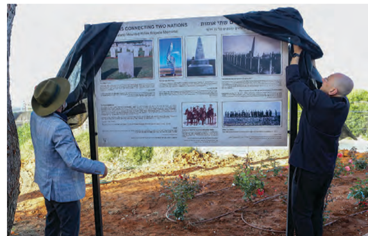
Unveiling the sign.