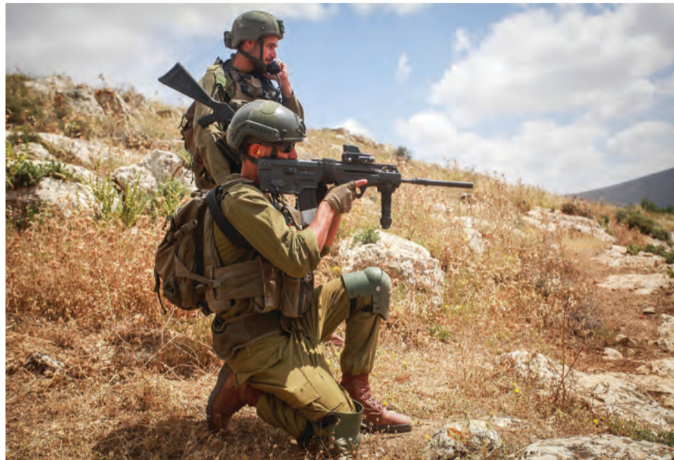
Palestinians protest while Israeli Security Forces stand guard in the West Bank.

Then came massive criticism of the Israeli government over its 'weak response'. National Security Minister Itamar Ben-Gvir challenged Prime Minister Benjamin Netanyahu to fire him for refusing to take