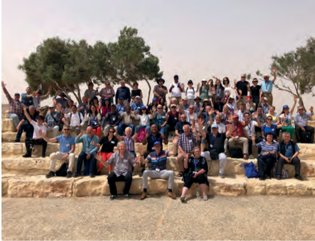
The participants at this year's Forum at Sde Boker.

Many of the people involved in the worldwide work of Christians for Israel International are volunteers. Spending time together strengthens our common mission to spread the Biblical message about Israel in our respective countries. Our international Forum is also a fascinating melting pot of languages and cultures. It is always impressive to see how people from Africa, Asia, the America's, Oceania and Europe live their faith, and experience the role of Israel in their faith.