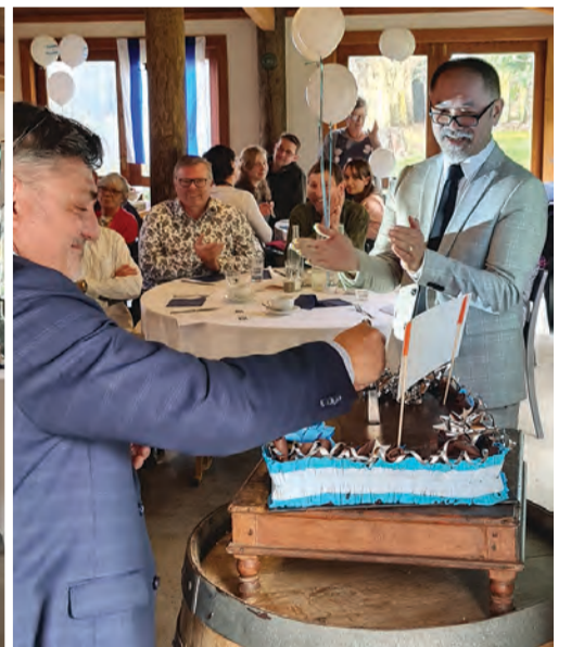
Photos at the Christchurch Ambassador's luncheon on 30 April.