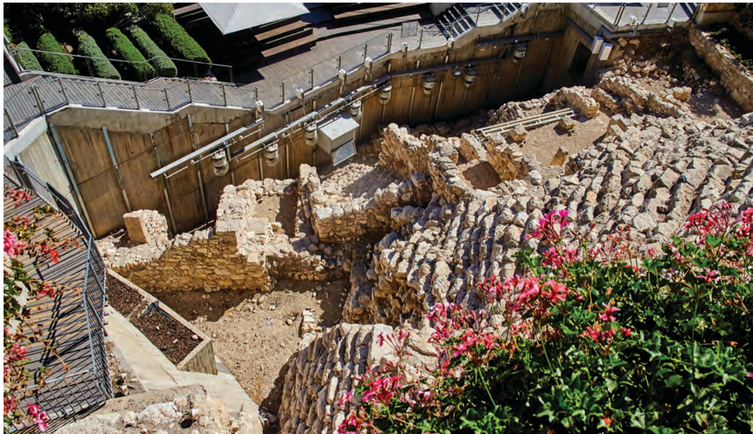
In the City of David, archaeological site revealed birth place of Jerusalem on Ophel Hill near the Western Wall.