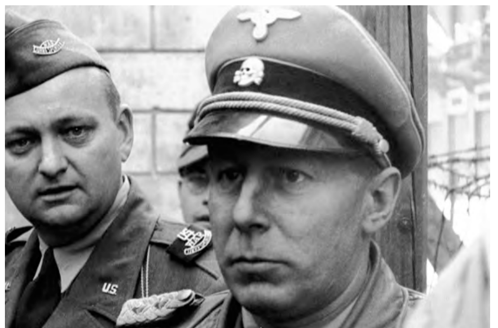
SS Colonel Walter Rauff (right, photographed after his arrest in 1945), inventor of the mobile gas chamber, was charged with carrying out a Holocaust of Jews in Palestine.

A new series of bloody pogroms took place in 1929, the victims of which included the Jewish community of Hebron. In the aftermath, London published a mandate policy document in October 1930 that proclaimed new immigration restrictions on Jews, as well as measures to make it difficult to sell property to Jews. That 'White Paper' also denied that the development of a Jewish national home would be the central mandate.