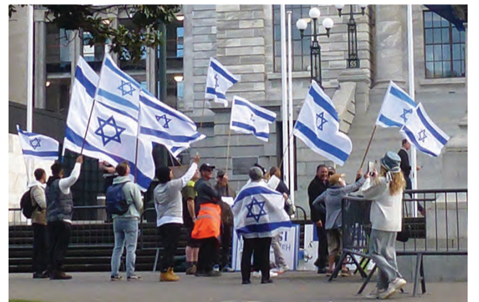
Israel supporters outside Parliament, Tuesday 16 May.