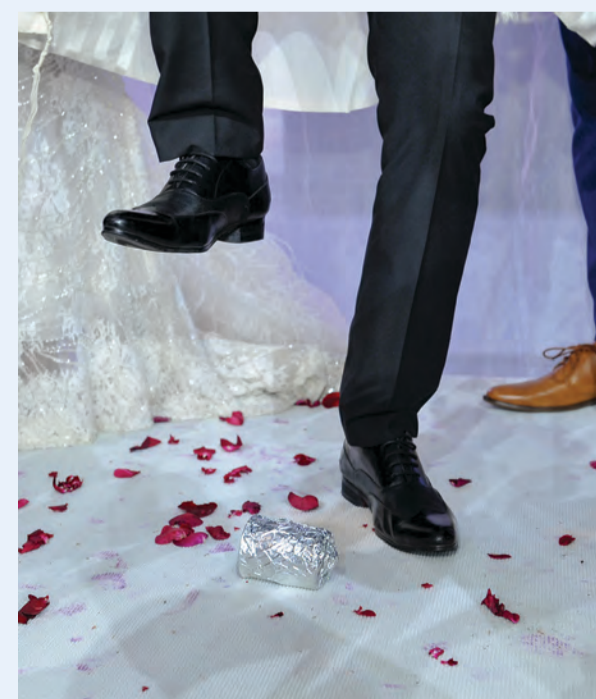
Breaking the glass at a Jewish wedding.

Joy cannot be complete until Jerusalem and the temple are rebuilt.