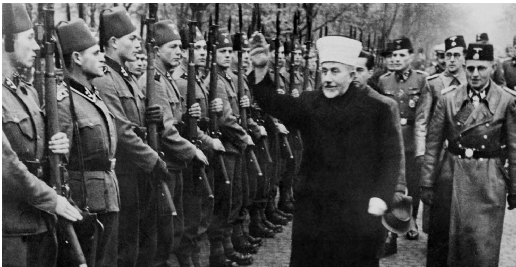
Mohammed Amin al-Hoesseini inspects a unit of the SS division Handschar, which he founded. This unit murdered 12,600 of the 14,000 Bosnian Jews.