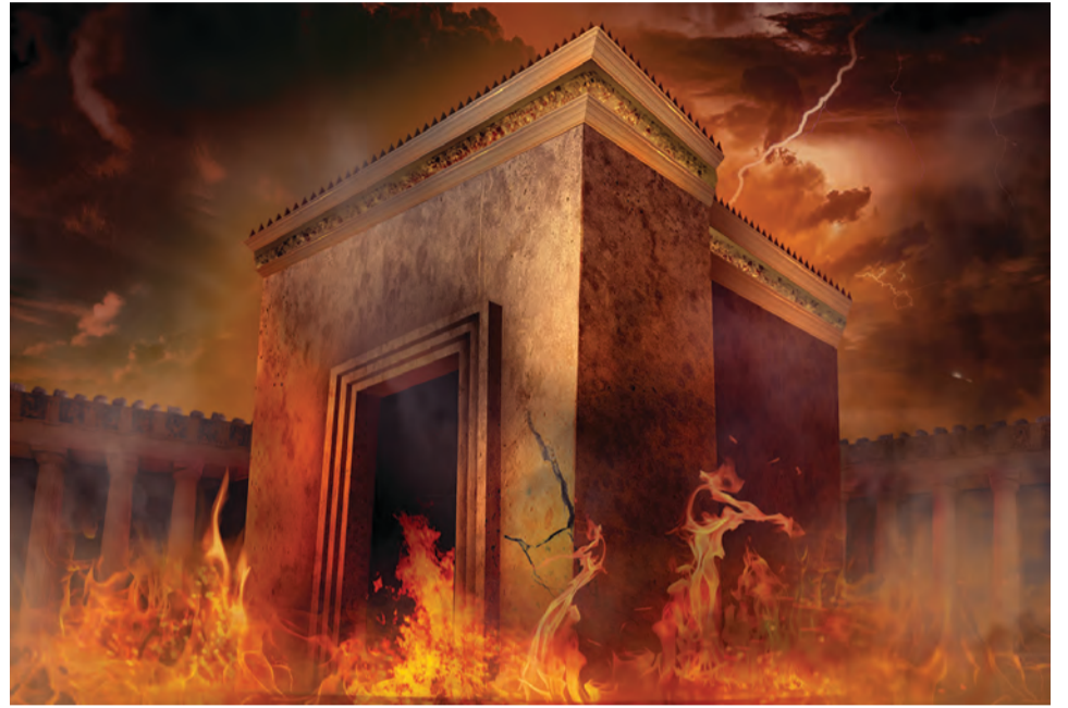
Destruction of holy Jewish temple in ancient history, Tish B'Av.

9 Av, in Hebrew Tisha be-Av , is a complete day of fasting. That means no eating or drinking from sunset to sunset, no washing, no wearing leather shoes and no sexual intercourse. No Torah is even taught. It is a day of mourning—one sits on the ground or on low benches. During the morning service, the tallit (prayer shawl) is not worn. One does not do that again until the afternoon.