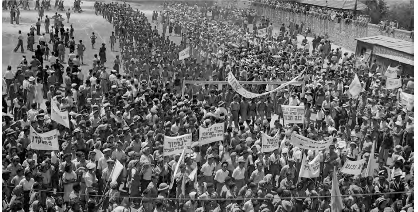
Jewish protest against Palestine White Paper, 18 May 1939. Demonstration at the Rehavia gymnasium in Jerusalem.

Secondly, in the main body of the Mandate document, Article 2 stated: "the Mandatory [Great Britain] shall be