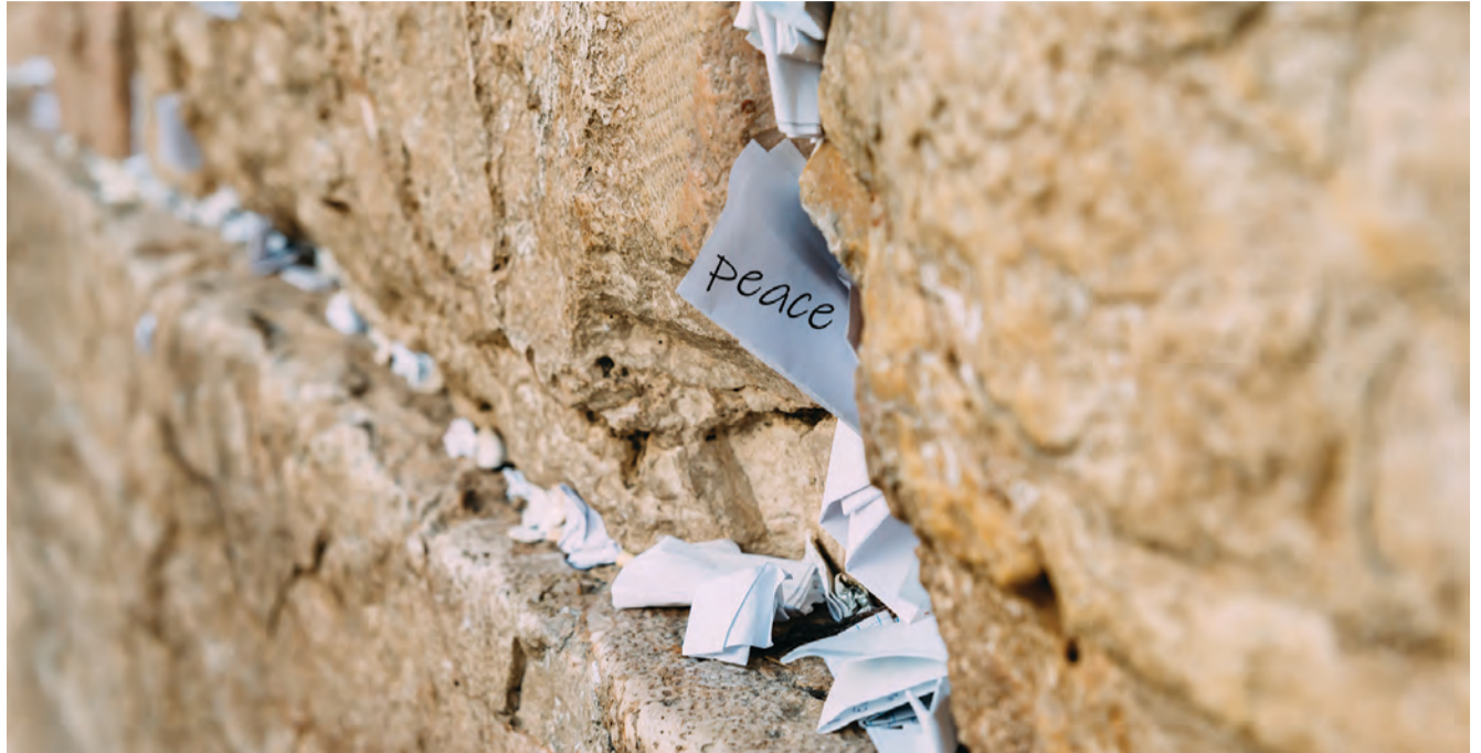
Notes in the Western Wall in Jerusalem, Israel.