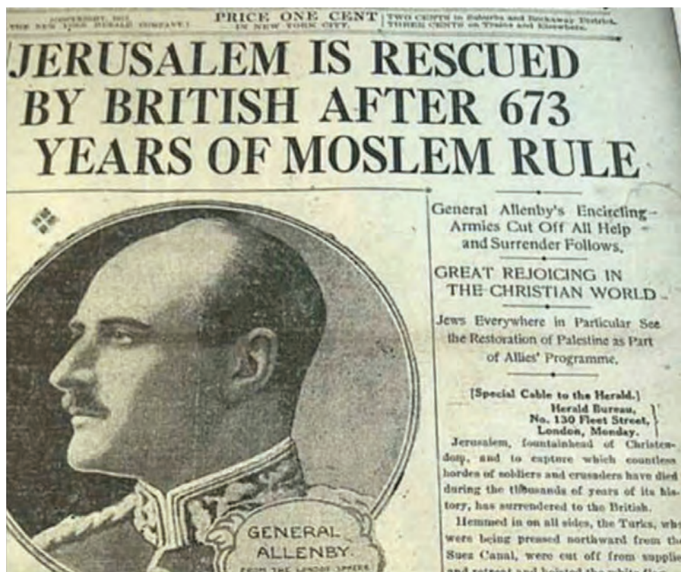
The British conquest of Jerusalem was greeted with jubilant headlines, as seen here in the New York Herald