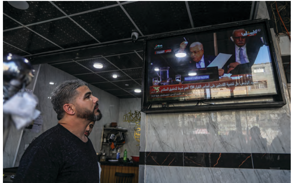
Palestinians watch the speech of Palestinian President Mahmoud Abbas on television from New York, in the city of Rafah, southern Gaza Strip, on 15 May, 2023. President Mahmoud Abbas speaks during a high-level event commemorating the 75th anniversary of the Nakba at UN Headquarters in New York.

But the victims are not entirely innocent. The fact is that, for one hundred years, the Arab-speaking peoples who live in the territory of Palestine have allowed