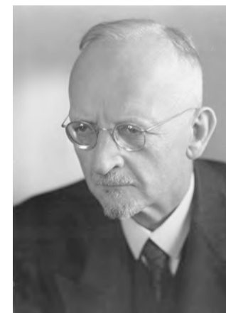
Prof Gerhard Kittel.

academic training and Bible knowledge, they had no real understanding of God's plan of salvation for Israel and for the world. Apparently, a person can be so stuck in rigid, dogmatic frameworks and feelings of aversion, that there is no place for what the Bible really says about Israel. We find such statements unacceptable in our time and call them antisemitic. We know where this all ended: the