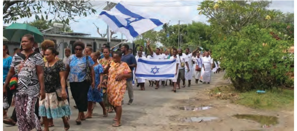
Youth Inter-denominational march and prayer for Solomon Islands and Israel.

declaration of standing with God's chosen people and with the nation of Israel.