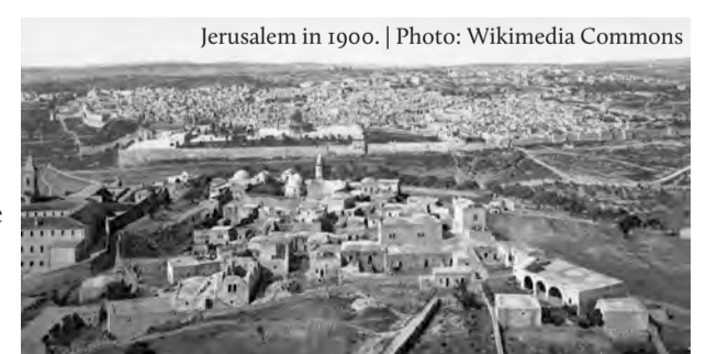
Jerusalem in 1900.

Today it is hard to see where the 1949-67 divisions lay. Post-reunification, the municipality has expanded the city to nearly 71 sq. km providing a new legal and political infrastructure. The goal was to unite the different groups under the Gafni Committee proposals and keep the demographic balance as it was in 1972 (73.5% Jewish and 26.5% Palestinian). Mayor Teddy Kollek (1965-93) became synonymous with the city, and a large park is named after him. Many of the new settlements were located close to the city for ease of access, including acting as dormitory suburbs with cheaper housing. Some of these