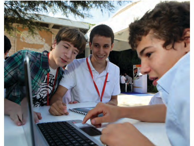
Young Israeli inventors at a congress.

Information Technology —Then there is a multitude of IT (information technology) inventions. It does not matter if you do not (re)know all of them: