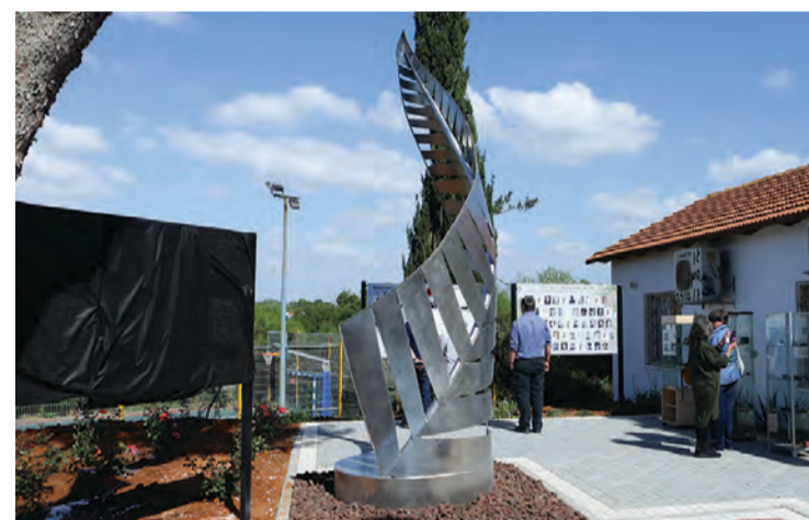
The Silver Fern Sculpture.