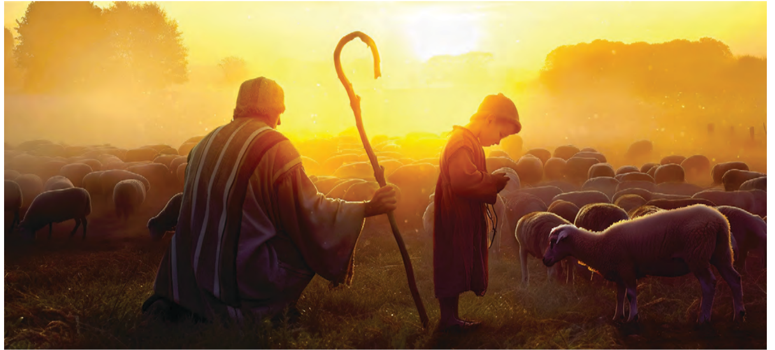
Jesus had already said, in John 10:16 : "I have other sheep that are not of this fold. I must bring them also. They will listen to my voice."