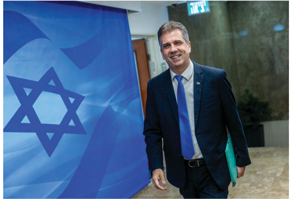
Foreign Minister Eli Cohen shoring up new allies for Israel in the fight against Iran.

Commentators specialising in Saudi Arabia see all these developments as proof that the government in Riyadh is only interested in its own interests but, at the same time,