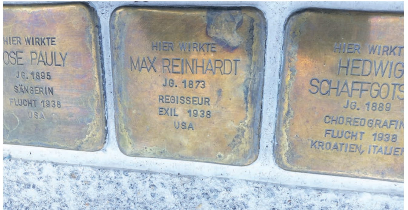
Three of the 'stumbling stones' including Max Reinhardt's stone, founder of the Salzburg Festival.

The Stumbling Stones have been given a prominent place in Salzburg. "It was of great importance for us to place