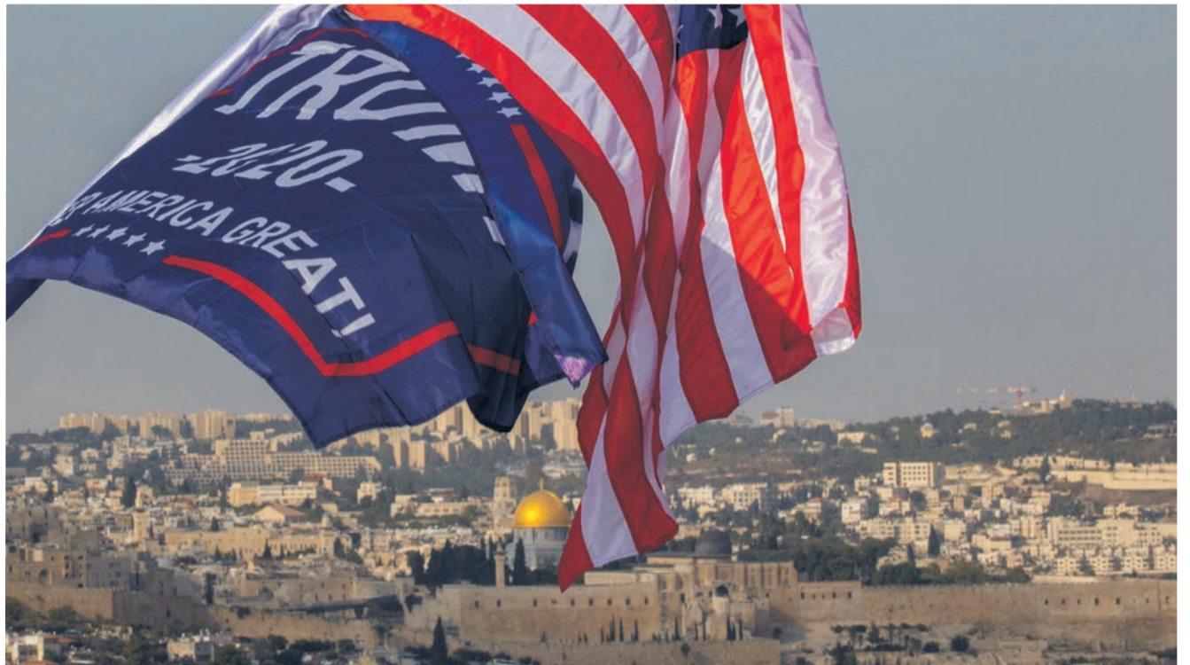
US flag and Trump campaign flag flying over the Old City of Jerusalem.

Worse, it has created perverse incentives. Basically, under the Obama/Kerry approach, negotiations on key issues like Jerusalem, borders and settlements are pointless as the PLO (which still advocates the destruction of the Jewish State of Israel) has no incentive to make any compromises whatsoever. If a breakthrough is to be achieved, these old assumptions must be reviewed. When we do so, we realise that they are based primarily on political positions taken by major powers in the 1960s-1980s - not sound legal analysis.