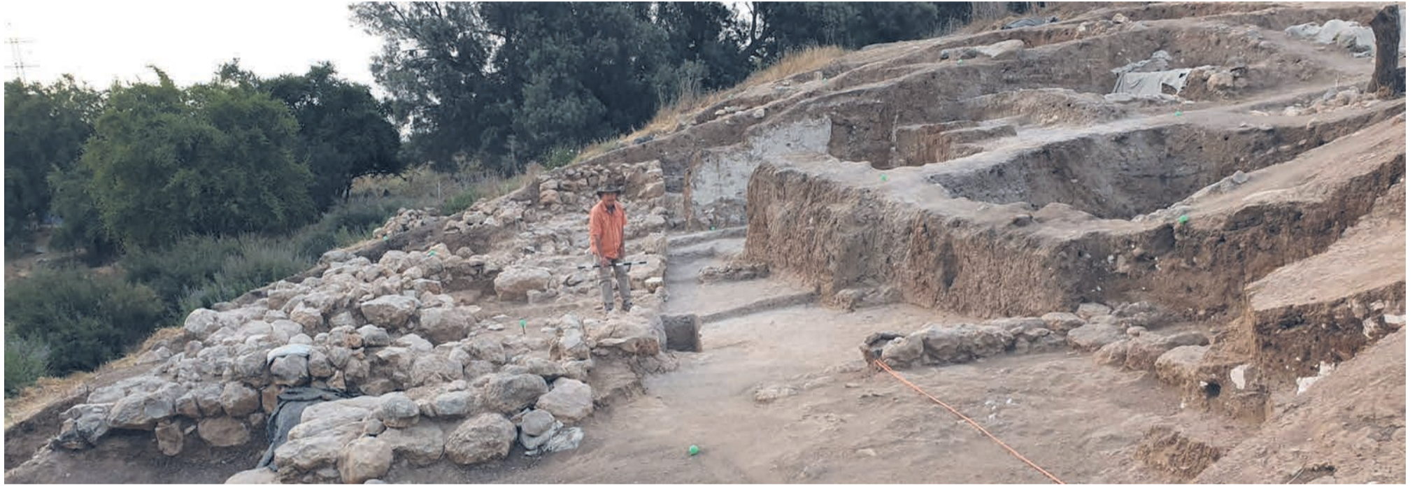
One of the gates into the lower city of Gath, 11th to 9th century B.C.E.