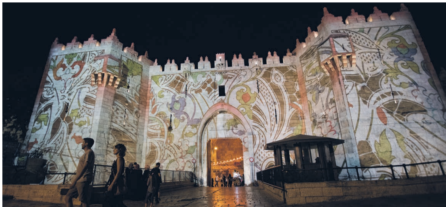
Lights projected on Damascus Gate in the Old City of Jerusalem.