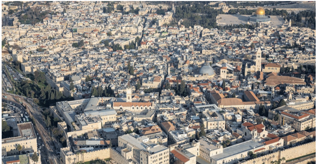
Aerial view of the Old City of Jerusalem.

The joint statement hypocritically calls "on both sides to abstain from any unilateral actions which would be contrary to international law." Yet both the EU and Norway are intentionally and knowingly taking 'unilateral' actions that 'violate international law.' According to the Oslo Accords, which are binding under international law, Area C of the West Bank is under complete Israeli jurisdiction and administration. Any act of building in these areas without an Israeli permit is a