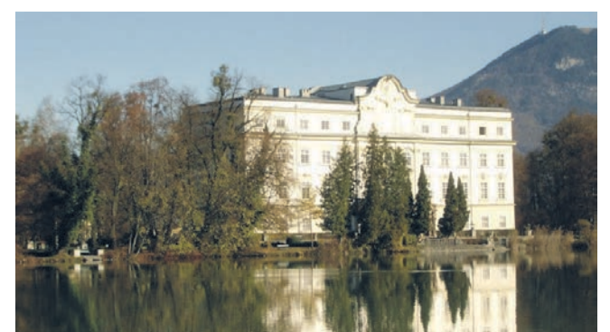
Leopoldskron Castle, the cradle of the Salzburg Festival.

His grave is located in Westchester Hills Cemetery in New York, where famous artists such as George Gershwin have their gravesites.