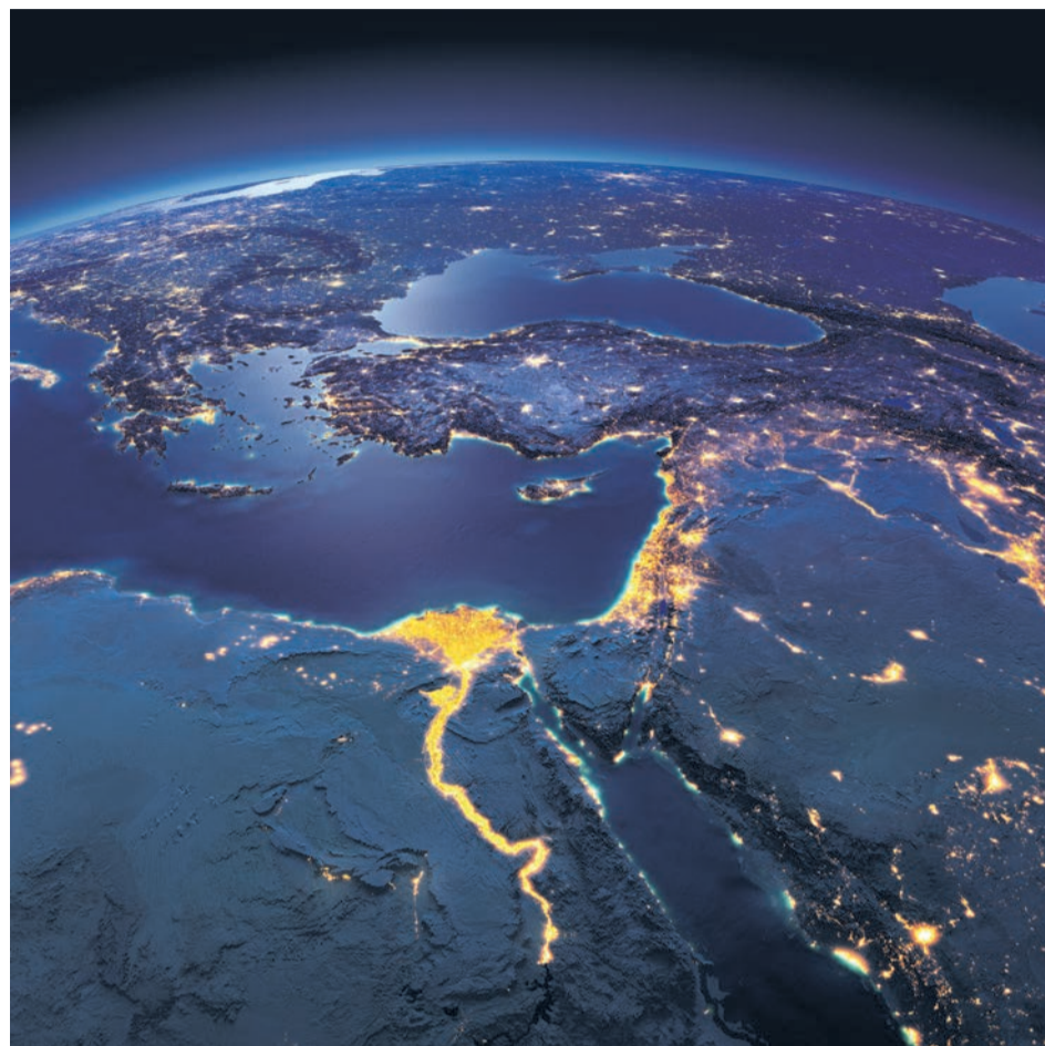
View of Israel from space.

The prophet Zechariah says: “Then the angel of the Lord said, “O Lord of hosts, how long will You have no compassion for Jerusalem and the cities of Judah, with which You have been indignant these seventy years?” The Lord answered the angel who was speaking with me with gracious words, comforting words’ ( Zechariah 1:12-14 ). Isn’t this wonderful? Here the angel of the Lord even intercedes for his people Israel before God. This reminds me of what Paul says about Jesus Christ the Messiah: ‘who is at the right hand of God, who also intercedes for us’ ( Romans 8:34 ). It is apparent that we may identify the angel of the Lord with the Son of God, the Messiah. This reflects a wonderful and everlasting deep connection between the