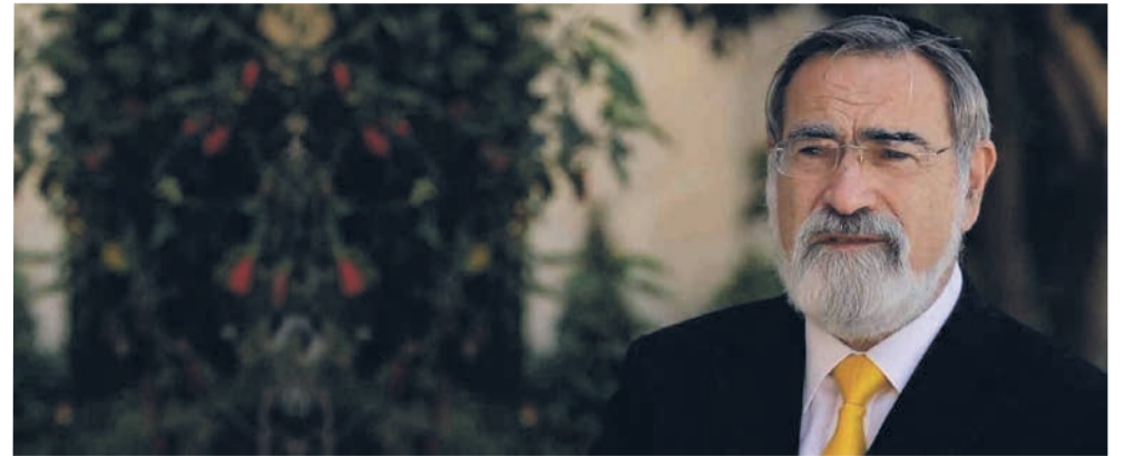
Rabbi Jonathan Sacks.

Sacks was as concerned about the persecution of Christians as he was about anti-Semitism because he understood their common root: hatred of the God of Israel. A few years ago, in a Lords debate on the treatment of Christians in the Middle East, Sacks reminded his peers of some famous words of Martin Luther King: "In the end, we will remember not