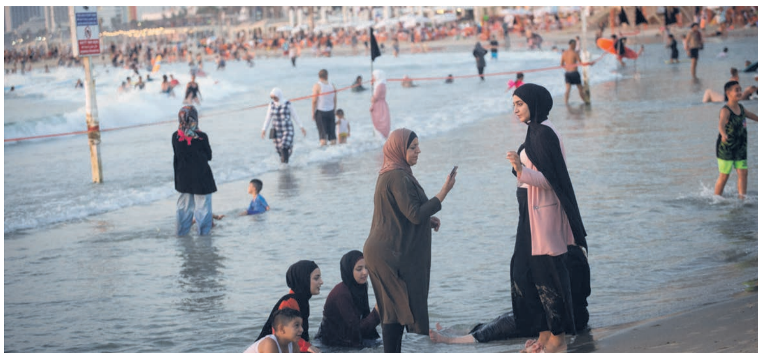
Arab women enjoy the Tel Aviv Beach.