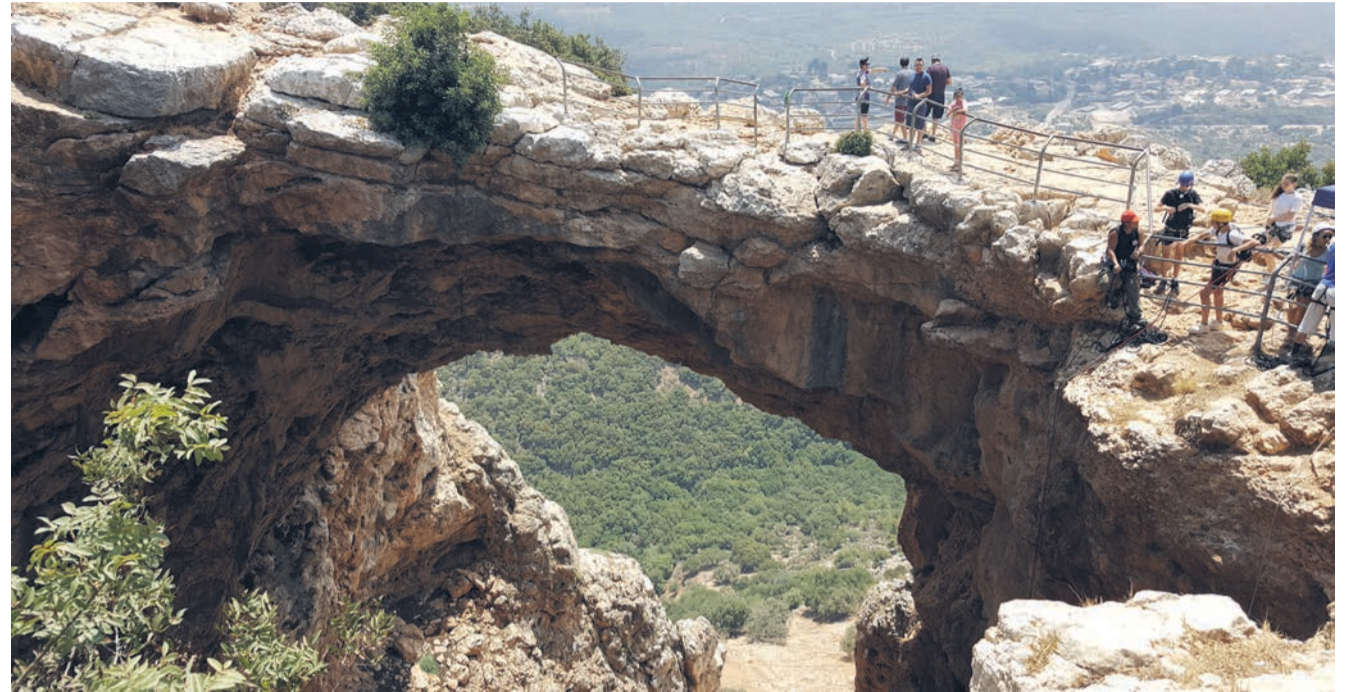
Keshet Cave (Rainbow Cave or Cave of the Arch), a natural arch on the ridge north of Nahal Betzet, Galilee.

2 Kings 14:25: (Northern Kingdom of) Israel's affliction was very great, so God raised Jeroboam II, who recovered the lost cities of Galilee.