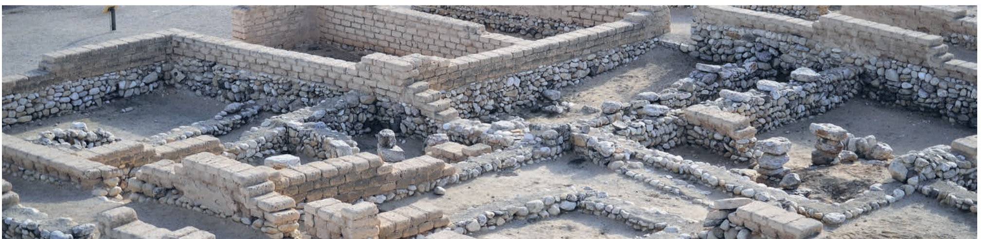
Tel Beer Sheba, Beer Sheva, Beersheva archaeological site, ruins of the ancient city, Israel, Negev Desert.

We may be in a desert through our own foolishness or rebellion, have been banished there by the actions of others (like Hagar in Gen 16 or government lockdowns), or have been drawn there by God ( Hos 2:14, Matt 4:1 ). In that place, make a choice to seek the mountain of God, set your mind to draw unto Him, enjoy the stillness and silence, and learn to trust the Lord, allowing Him to prepare you for the next move. God’s voice can be heard clearly in the desert, when all other voices are blocked out. Stand against the enemy’s arrows of discouragement and despair ( 1 Cor 10:6-13 ). It is easy to become disoriented and wander in the desert, so call out to God for guidance ( Ps 105:40-41 ). Do not grumble as Israel did ( Ex 16:8 ), but look for the miraculous provision of God ( Ex 16:4,12, Mk 8:1-9 ) and see Him transform your desert into a fruitful field ( Is 35:1-6 ). How long we stay in the wilderness is often related to how teachable we are and how quickly we learn the lessons God is trying to teach us. When we conquer the desert, we will defeat the enemy for the enemy is not people or giants, it is the desert itself. The real enemy is within.