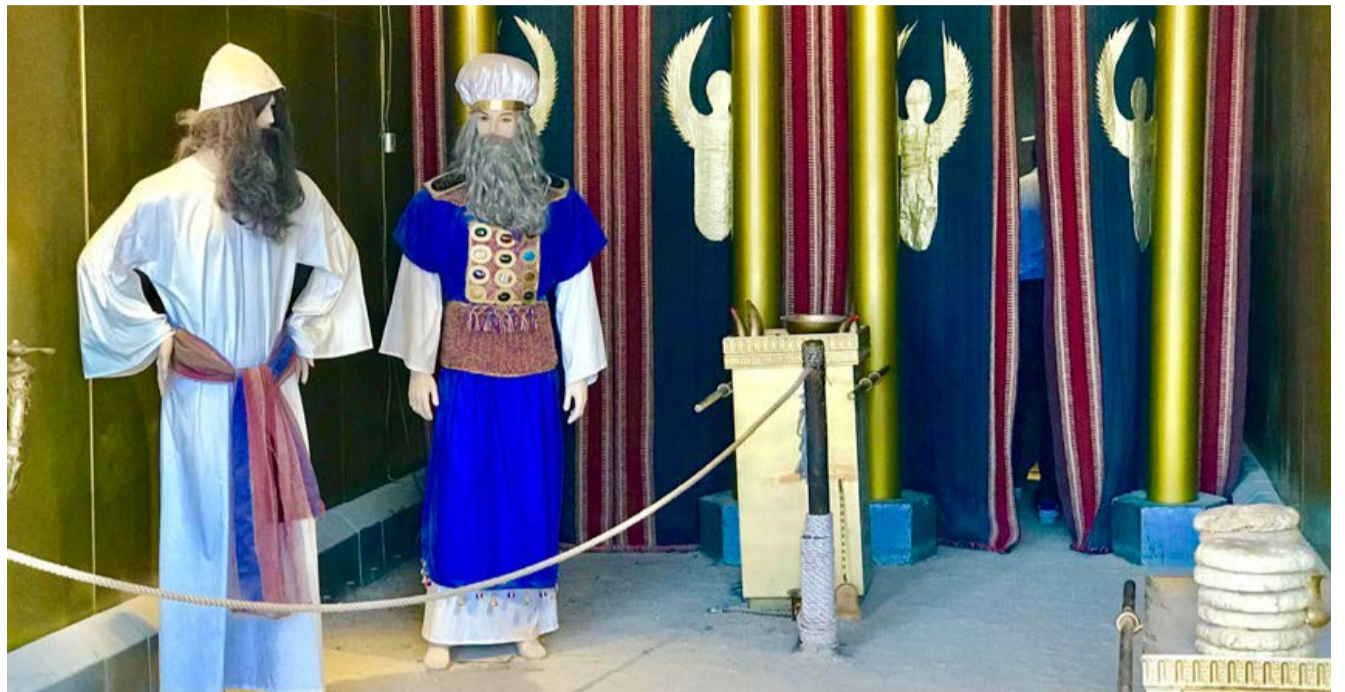
Inside the Tabernacle in the Wilderness, with mannequins of what the High Priest may have looked like with the full priestly garments and with the simpler white robe.

The High priest then took off his garments in the Tent of meeting, washed and changed into his High priest's robes, came out and offered the rams as burnt offerings; one for himself, and one for the people, to make atonement. He also burnt the fat of the sin offering on the altar. The bull for the sin offering and the goat for the sin offering, whose blood was taken in to make atonement in the Holy of Holies, were taken outside the camp; their skins, their meat, and their waste was burnt in the fire. Lev.16:23-28.