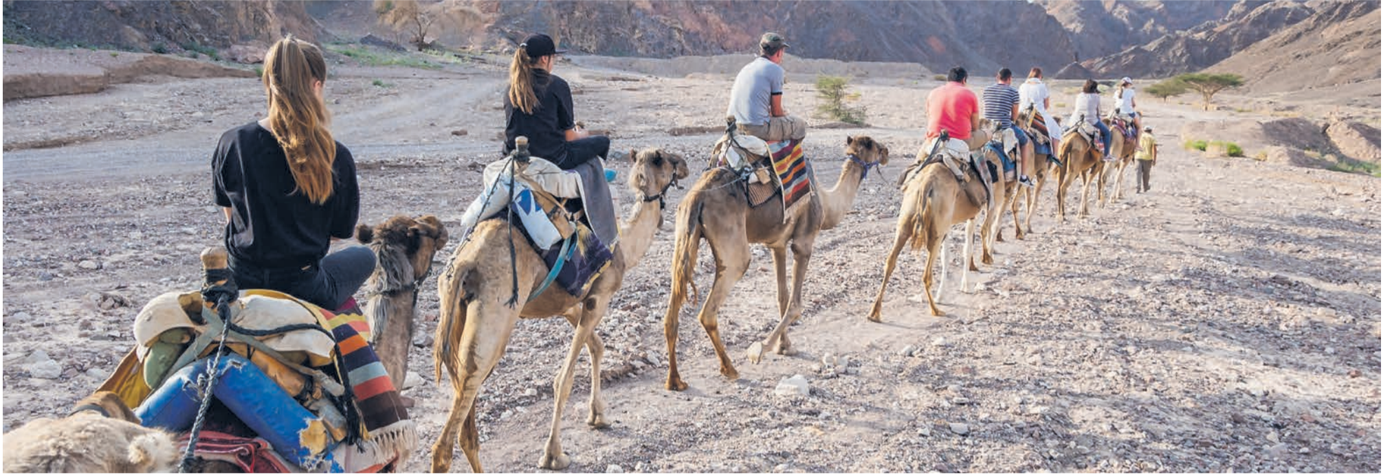
Caravan of camels with tourists walking in a row in Eilat Desert.