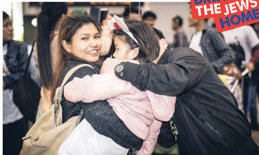
Arriving in Israel is very special and emotional for the Bnei Menashe. They are received with joy by family and members of the Bnei Menashe who are already in Israel.