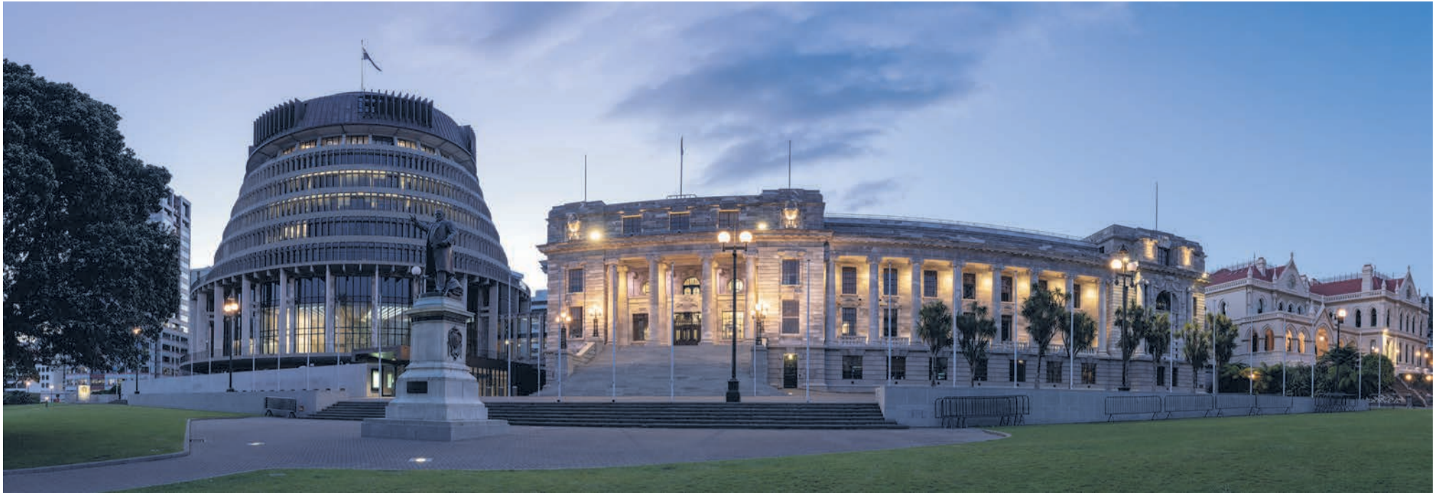
New Zealand's Parliament buildings, including the beehive, taken at twilight.