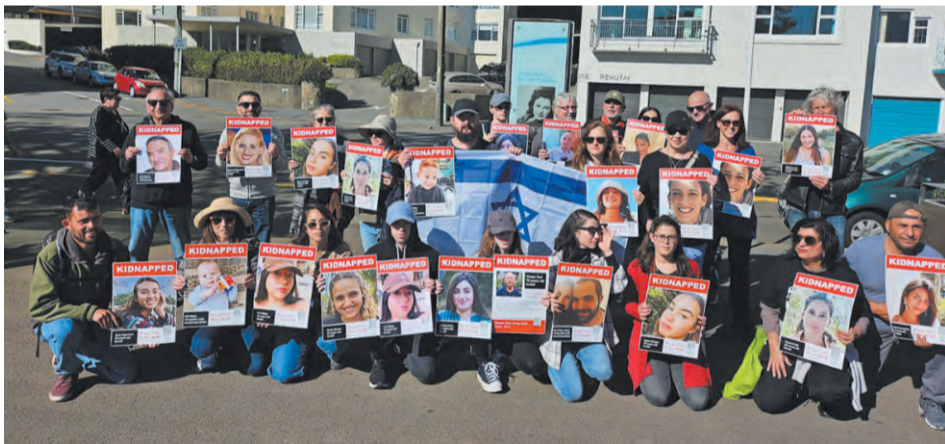
Wellington Run for their Lives group in front of Nancy Wake Memorial.