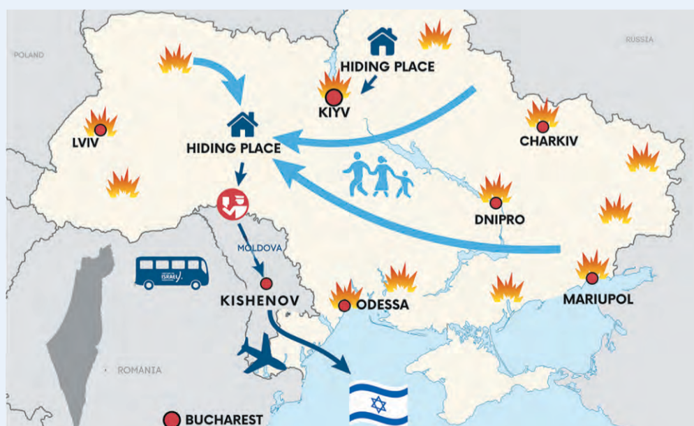
This map shows the situation in Ukraine and how we bring olim to Moldova from where they fly to Israel.

Christians for Israel assists new immigrants (in Hebrew: olim ) to integrate into Israeli society through the 'First Home in the Homeland' project. Young families are provided with a warm home on a kibbutz for their first six or twelve months in Israel while following an intensive Hebrew course.