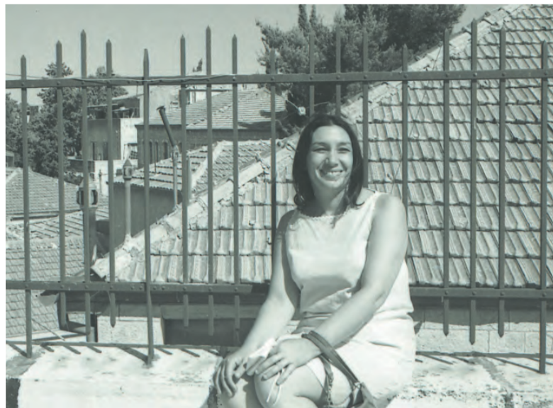
Naomi Shemer in Jerusalem in 1967.

Shemer translated the poem ' Oh Captain, my Captain '