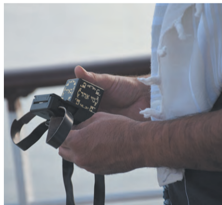
Jewish man holding Tefillin.

Right now, God’s people are almost back to the state they were in on 6 October 2023, tearing each other apart over political ideologies... left vs right... and it’s become dangerous. They are at war, and their enemies are watching, laughing and waiting for another chance