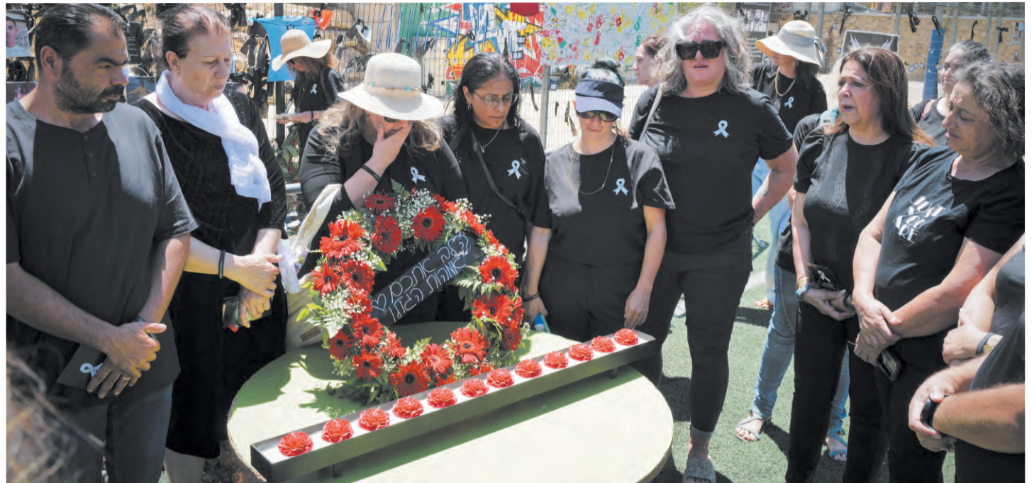
A delegation of Jewish mothers living in the Golan Heights at the Druze village of Majdal Shams, to comfort the mourning parents of the twelve children who were killed by a Hezbollah missile attack.

Haniyeh, who was filmed bowing to his inferior god in gratitude while watching footage of Israelis being murdered, was abhorrently coined as 'a moderate' and a