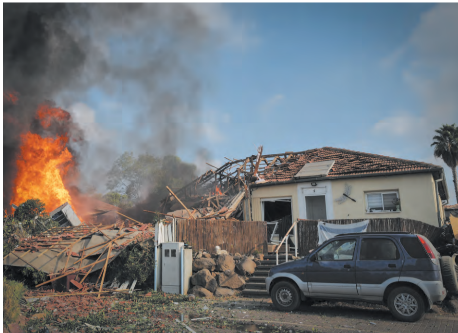
For residents of northern Israel, the 'ring of fire' is a daily reality. Since 7 October, Hezbollah has been firing rockets almost daily with the aim of causing as much death and destruction as possible. As a result, tens of thousands of residents have had to leave their homes and be relocated.

The Islamic death sentence on Israel and the Jewish people have been openly and unabashedly propagated for decades, in particular by Iran and all known Islamic terror organisations, but also from mosques in the Western world. Since 7 October last year such propagation has been voiced at numerous US and European universities, with countless non-Muslim 'useful idiots' loudly endorsing the antisemitic verdict.