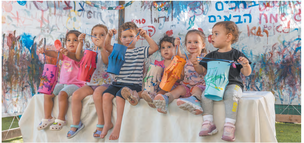
Jewish children learning about the customs of Sukkot at a kindergarten.

But Sukkot is not a sombre and subdued feast. On the contrary it is full of exuberant joy. There is a Biblical