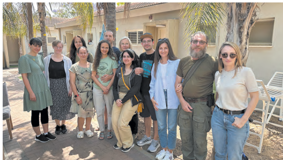
Olim in Kibbutz Or haNer, near Gaza, who have just returned after being evacuated.

In Austria, we are witnessing a profound change in the relationship between Christians and Jews. More and more pastors have begun to investigate the history of their church and its location and have begun to repent in the presence of the chief Rabbi and local Jews. There