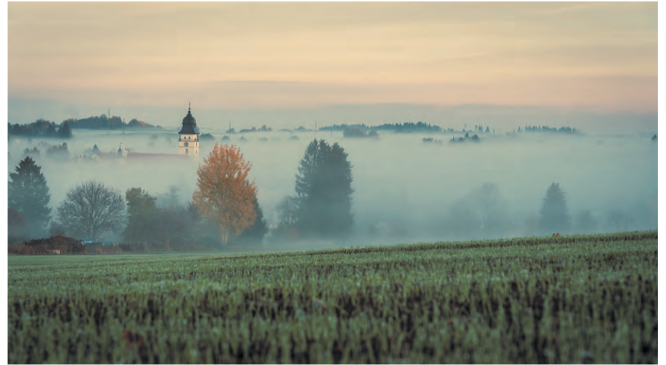
Illustrative photo.

Far too many church leaders remain silent, misled by the media and afraid of causing division in their congregations, but I sense a growing grass-roots support in the UK for the Jewish people. More contacts are being made between Christian and Jewish leaders, more help is being given to support aliyah , sadly increasing from the UK, more prayer is happening, and the church is waking up to the need to speak truth regardless of persecution.