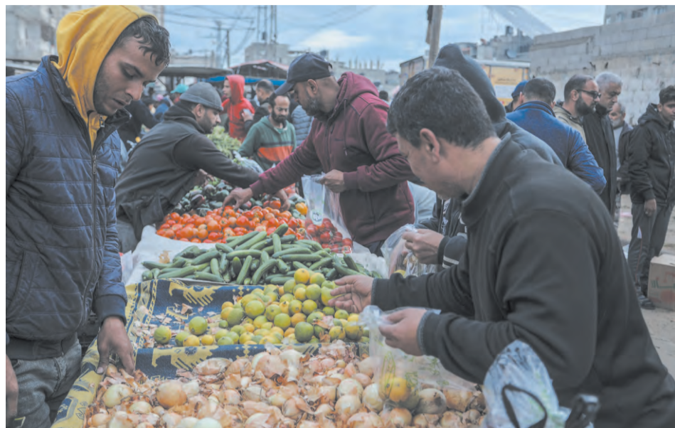
Palestinians buying food from the market in the Gaza Strip, on 13 January 2024.

Hamas is refusing any offer that sees the release of hostages. In their thinking, the hostages are their bargaining chip for the release of thousands of terrorists. At the moment, they believe and tell their people they are winning the war. Reminiscent of Nassar in 1967, telling Jordan, come join us; we are winning and destroying Israel. Hamas leaders are