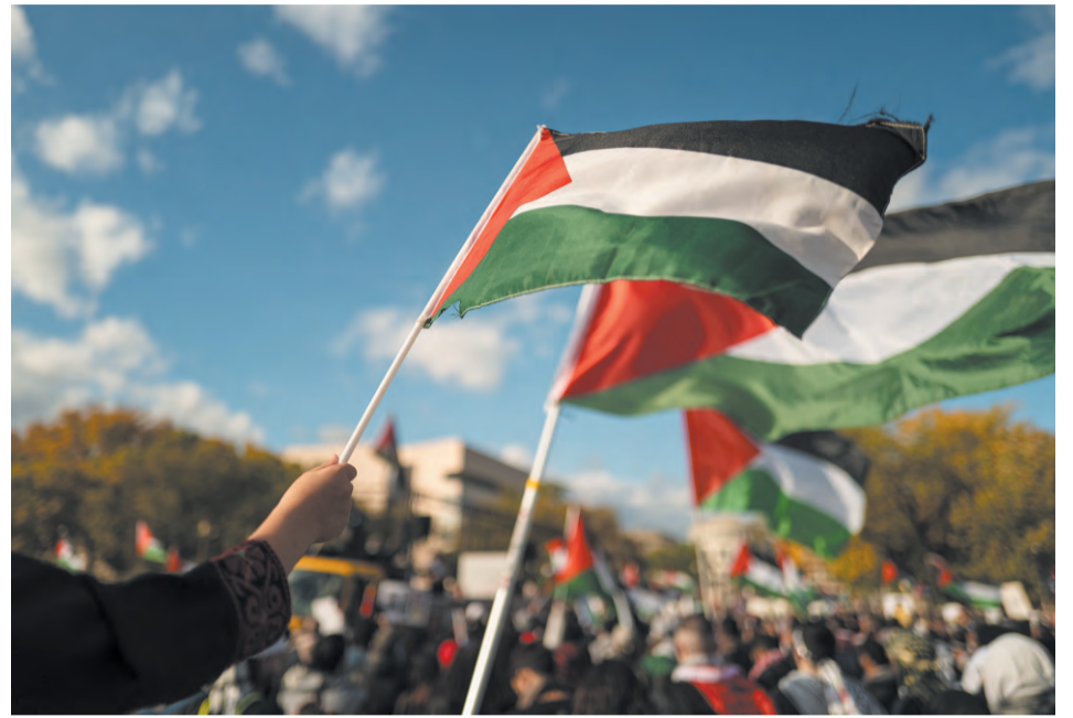
Anti-Israel protesters in Washington, USA, 21 October 2023.

Its appeals often have photos of suffering children coupled with messages of potential starvation. This has added to the perception that Israel is oppressing the Palestinians.