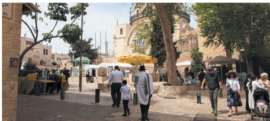
The Jewish Quarter of the Old City of Jerusalem with the Hurva Synagogue.