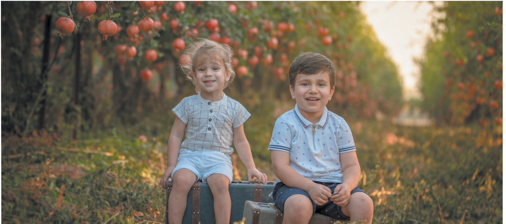
View of a field of pomegranate trees in Israel. Pomegranates are used in the Jewish ritual of the new year because they supposedly contain 613 seeds, and by eating the pomegranate Jews display their desire to fulfill the 613 commandments written in the Torah.

www.c4israel.org.nz | info@c4israel.org.nz