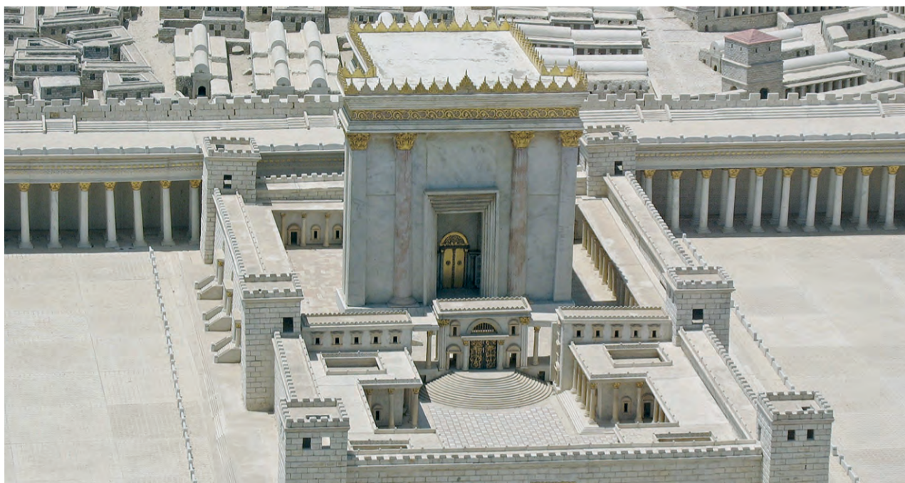
A model of the second Jewish temple in the Israel Museum in Jerusalem.

This movement from destruction to redemption is also