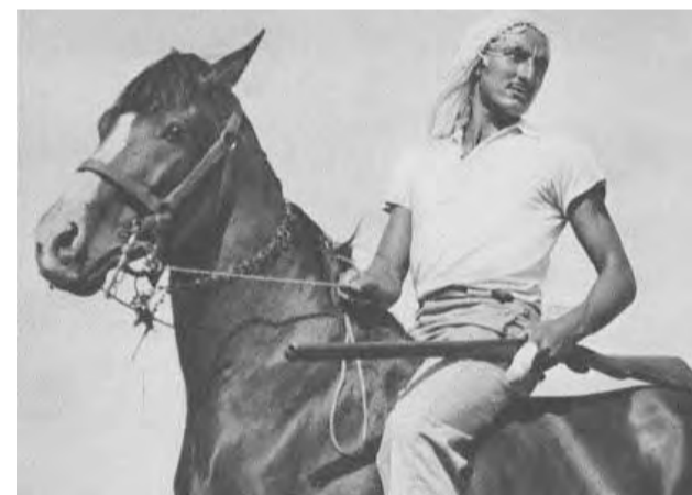
Watchman of Jewish settlement (1930s).

the Arab League proclaimed “a war of annihilation.” With the British withdrawal and the invasion of Arab armies, the civil war turned into the 1948-49 War of Independence. The Jewish Quarter in the Old City of Jerusalem was captured by Jordan and all Jews were expelled. An Arab commander commented “For the first time in 1,000 years, not a single Jew remains in the Jewish Quarter. Not a single building remains intact. This makes the Jews’ return here impossible.”