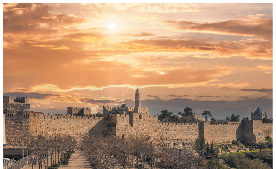
Panoramic skyline view of the Old City of Jerusalem.

Therefore, we press on, watching and praying towards that glorious day!