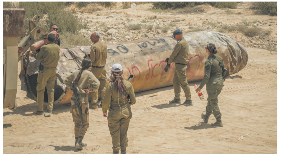
This is one of over 300 rockets Iran fired at Israel last April, hoping to inflict as many casualties as possible. As if by a miracle, not a single missile struck a target. Meanwhile, Iran threatens daily to hit Israel in the heart with a multiple of this number of missiles.

The 'ring of fire' is formed by Hezbollah in the north; Iran and a number of Tehran-controlled Syrian and Iraqi militias in the east; Hamas and Palestinian Jihad in the south; the Yemeni Houthis in the southeast; and the PLO and Hamas in the heart of the Land of Israel. This uncompromising coalition arrayed against Israel receives political, financial and organisational support from two state actors: NATO member Turkey and Qatar.