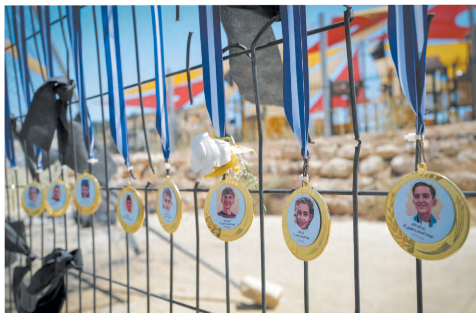
The young victims of Majdal Shams.

At the time of writing, Israel is waiting for the raging response that Iran has avowed, born from their shame. It seems inevitable, and there is an edginess in the air. But no matter how tense it is here, when Iran does attack, unlike our enemies, we can hold our heads up high because as long as we continue to do the right thing, our pride will never be damaged, and unlike the Iranians, we will continue to hold our heads up high.