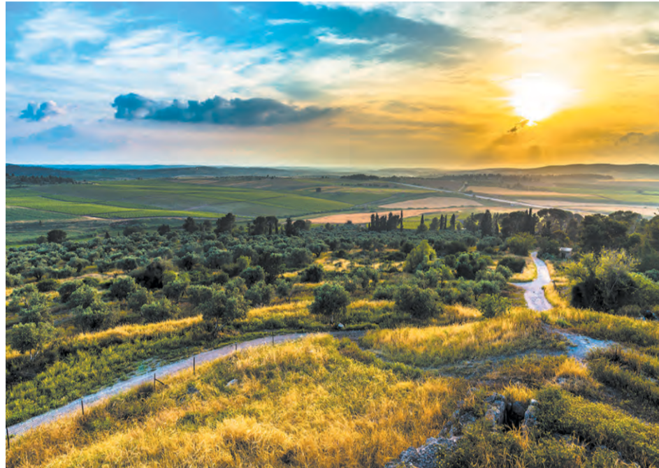
Sunset sky over fields of the Biblical Ajalon Valley, mentioned in Joshua 10.

Jerusalem to battle” (14:2) . Just as God put a hook in the jaw of Gog and brought him forth to his swift demise ( Ezekiel 38:4 ), so the Lord will gather the nations to battle against Jerusalem, and it will be their undoing. The continuous and growing global antagonism—and antisemitism—against modern Israel will turn into military action. It will be a bloodbath.