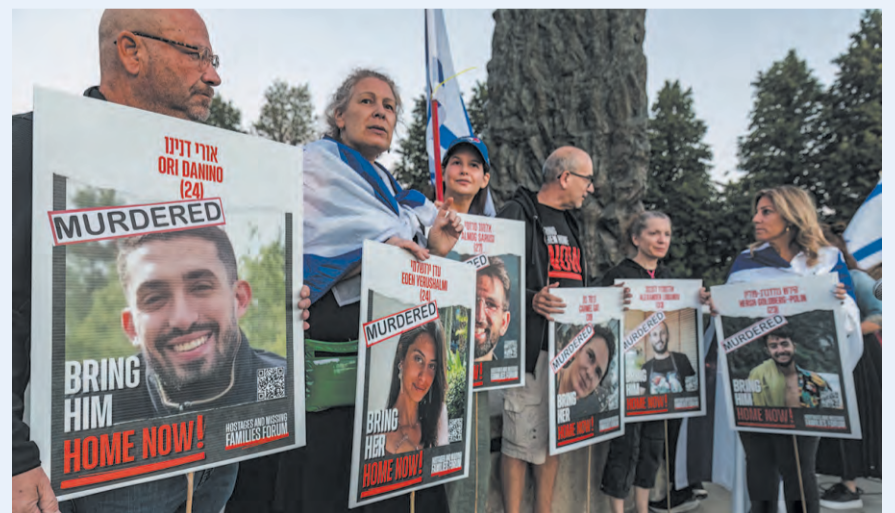
The faces of the six murdered hostages found in Gaza.

The news that the six hostages were brutally murdered just hours before Israeli forces got to them, sent Israel into shock early September.