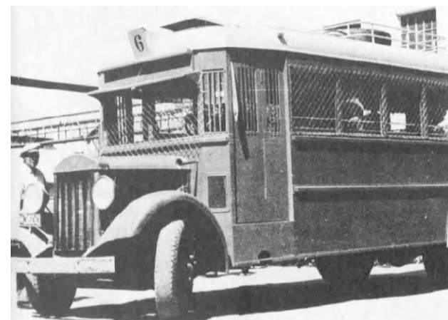
Armoured bus used to protect against Arab attacks.