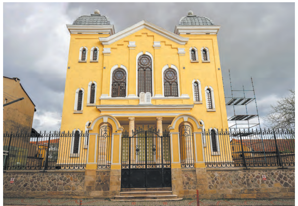
Edirne Grand Synagogue on the European side of the Bosphorus strait, is Turkey's largest synagogue and the third largest in Europe reflecting the significant historic size of Turkish Jewry.

Foreign Jews began arriving in Lebanon in 1809 from Akko, then Greece and North Africa from 1837 followed by Syrian Jews and those from Iran and Iraq came 1900-1955 as business and trade opportunities opened up.