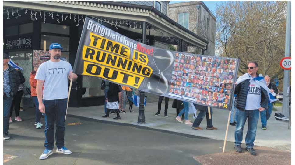
Israel support march for the hostages in Auckland, New Zealand, 14 September 2024.

Like so many nations that used to be known as ‘Christian’, those of us who still read our Bible and still listen to God are a rapidly diminishing share of the NZ population. Even smaller—less than 10,000—is the Jewish community here. As followers of the same God, the Jewish and Israel-supporting Christian community grow ever closer as we stand