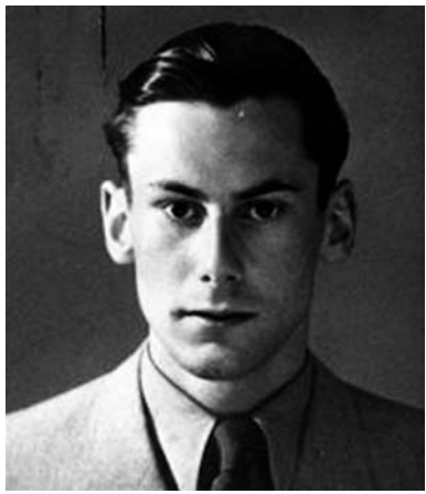
Eugenio Pacelli, Pope Pius XII