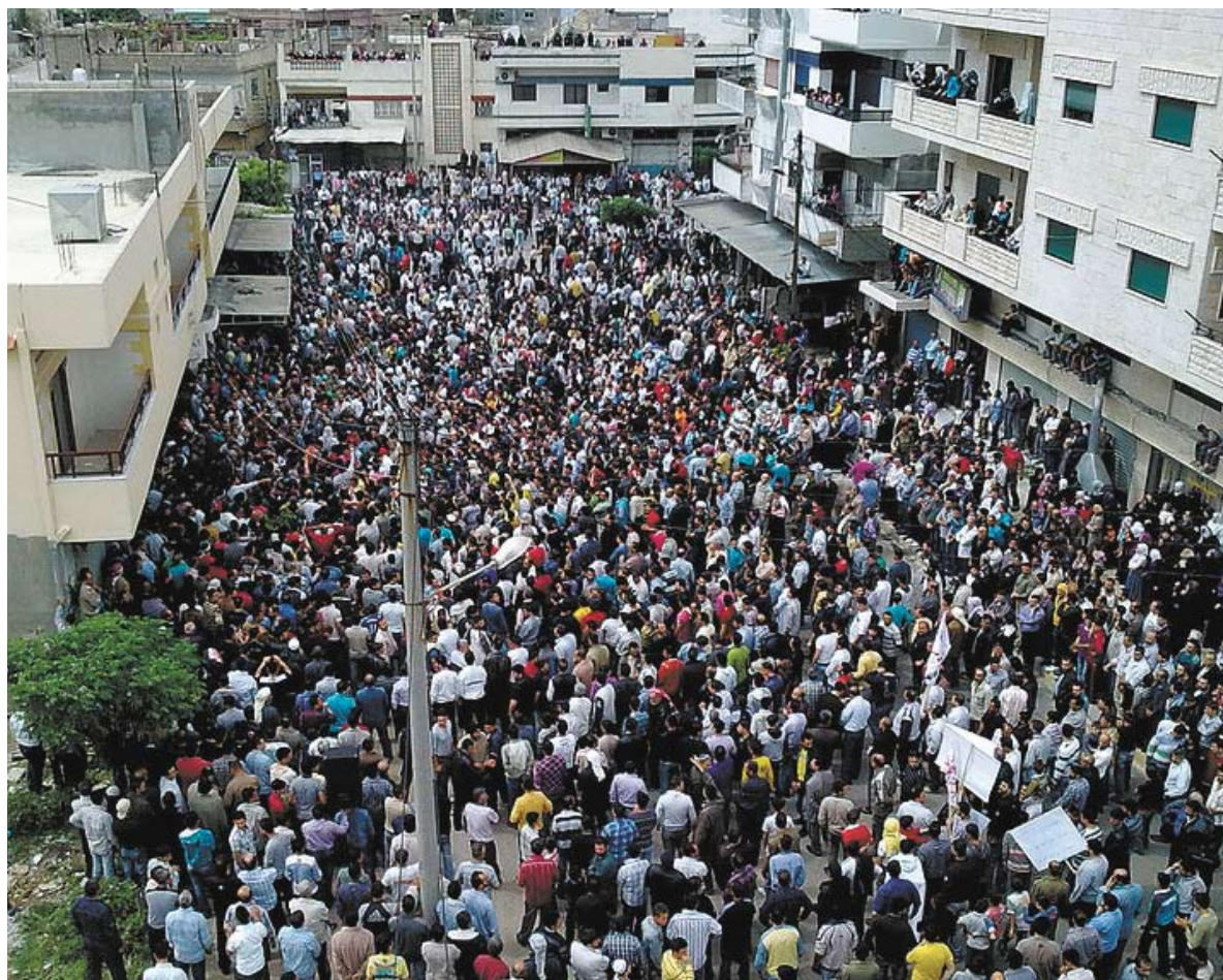
A demonstration in the city of Baniyas, Syria

This brings us to the effect of these events on Israel. At present, Egypt is by far the most important