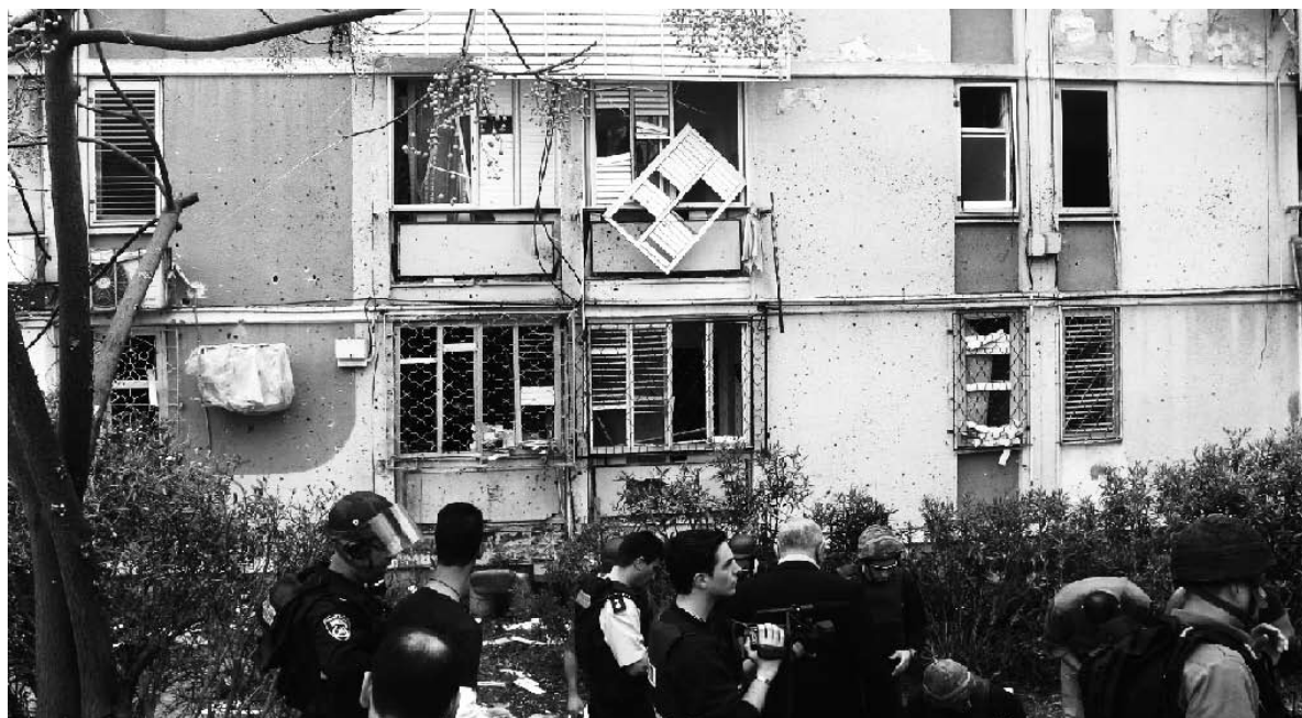
Rockets and missiles have rained down on southern Israel from the Gaza Strip

Your reaction to this imagined scenario is, no doubt, incredulity. The very thought of terrorists in another country attacking Americans at random is ludicrous. You know the president would immediately order the U.S. military to respond, root out the terrorists and make sure that the Canadian or Mexican governments clearly understood that this behavior would not be tolerated. The United Nations Security Council would immediately condemn this infringement on a country's sovereignty and the safety of its citizens. The U.N. charter makes