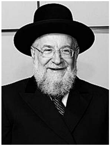
Rabbi Israel Meir Lau

Rabbi Lau: As believing Jews, we have a dual obligation of "zachor," to remember, and "lo tishkach," to not forget. The Sifrei explains the distinction between the two: lo tishkach refers to what takes place in one's heart, while zachor refers to actions that serve to remind people. When a person says Kaddish, lights a yahrtzeit candle or learns mishnayot, these are all in the realm of zachor. Zachor is not just a spiritual act; it is something active.