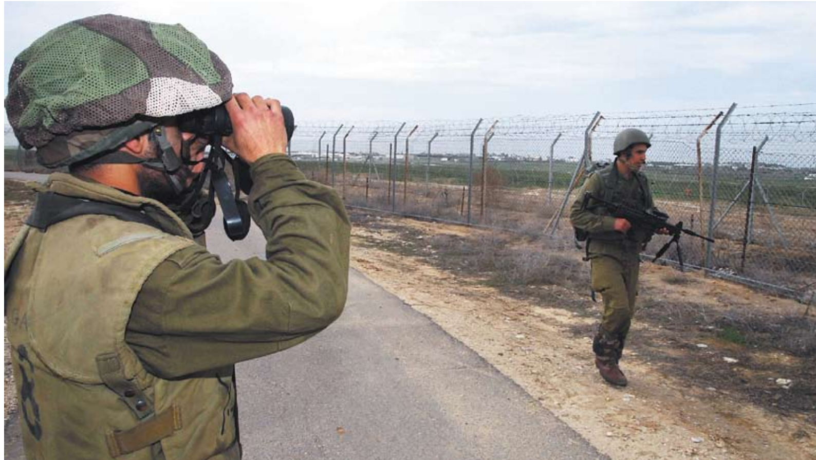
IDF soldiers on Gaza border

Victory in the case of the war with the Gaza terrorists would mean annihilating the Hamas. Interestingly, here is an increasing chorus of voices inside Israel now calling for peace through victory. One of these is General Dan Halutz, the controversial erstwhile chief of staff of the Israeli army. A