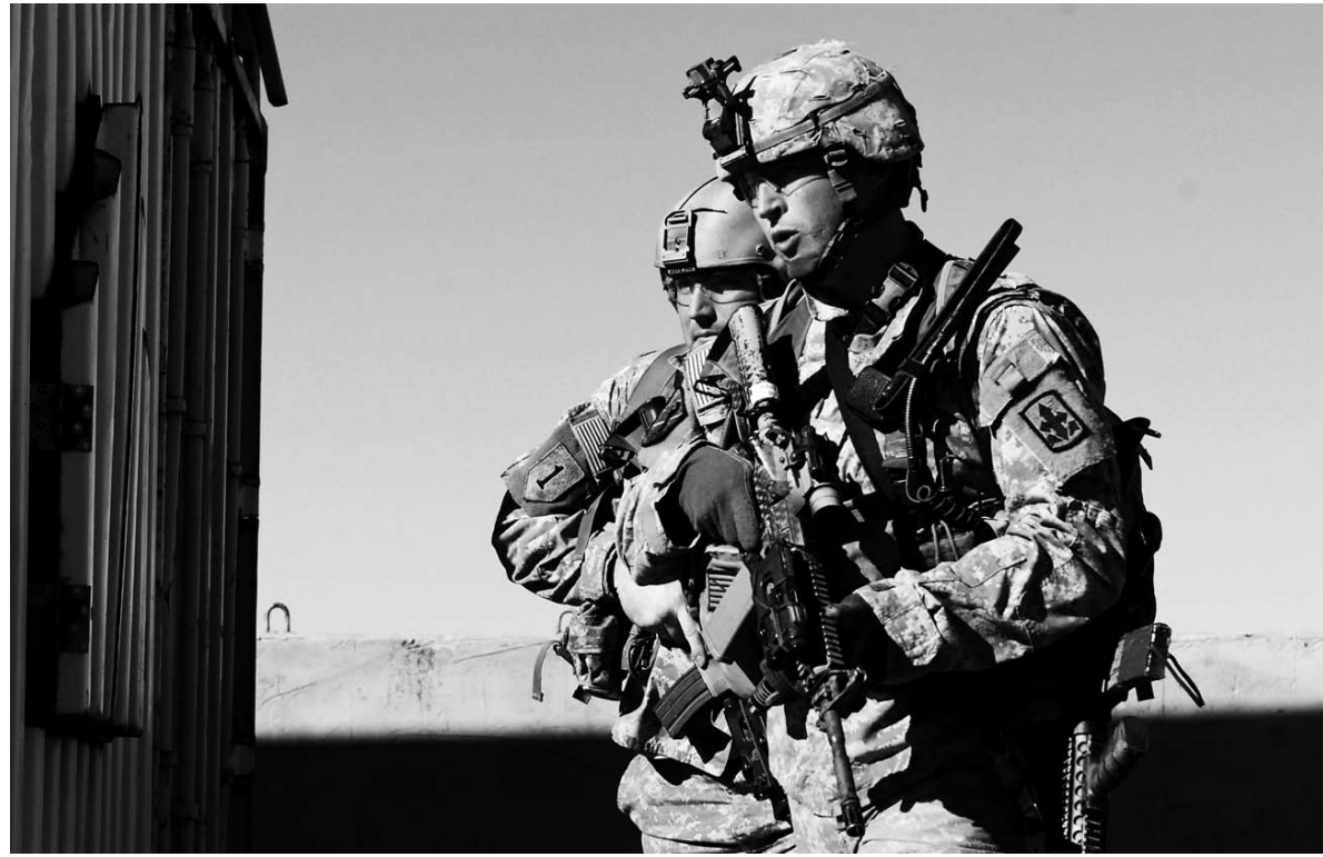
American soldiers now in Israel

Tehran too is walking a taut tightrope. It is staging military’s maneuvers every few days to assuring the Iranian people that its leaders are fully prepared to defend the country against an American or Israeli strike on its national nuclear program. By