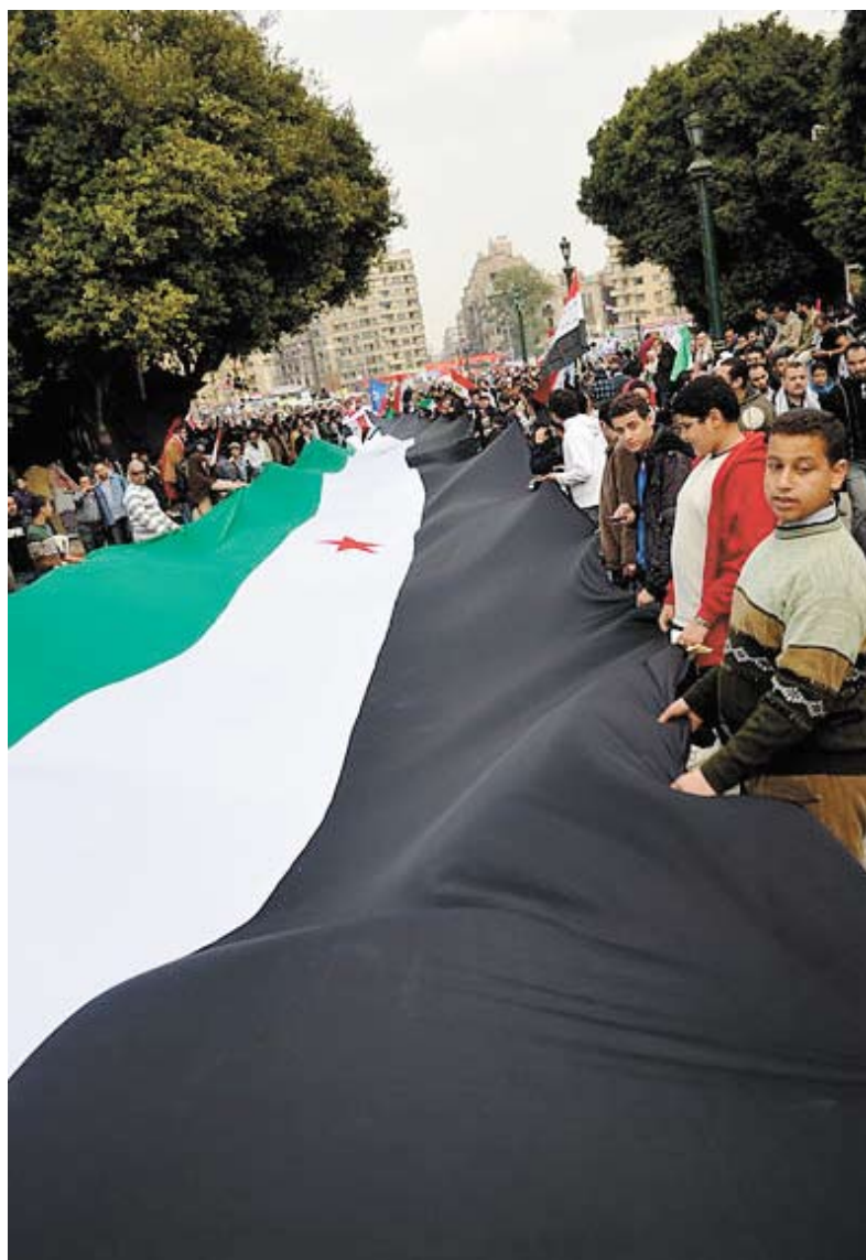
Protesters in Cairo with huge Syrian flag